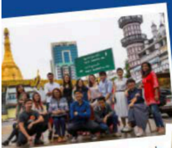
Going Overseas For Advanced Reporting (GO-FAR)