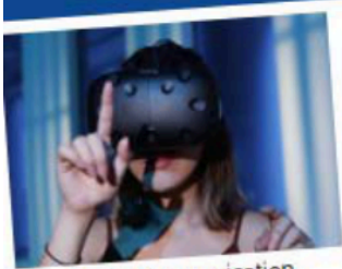
Asian Communication Research Centre (ACRC)