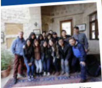
Short Overseas Journalism (SOJOURN)