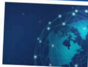
Centre for Information Integrity and the Internet (IN-cube)