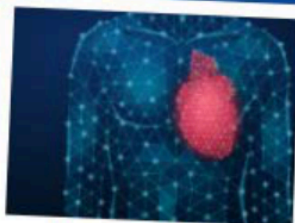
Centre for HHealthy and Sustainable cities (CHESS)