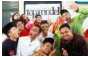
HARI RAYA DEEPAVALI