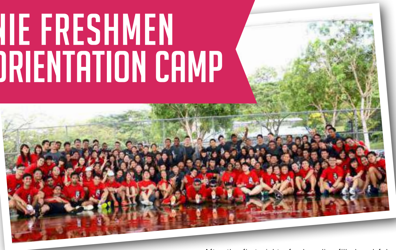
Freshmen are welcomed to NIE with an exciting, fun-filled, zombie-themed camp!