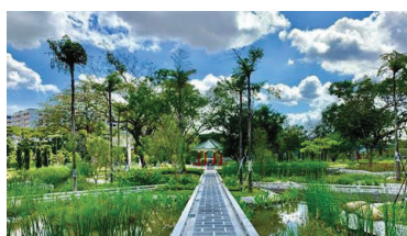
our beautiful campus