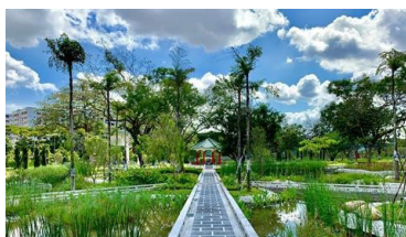
our beautiful campus