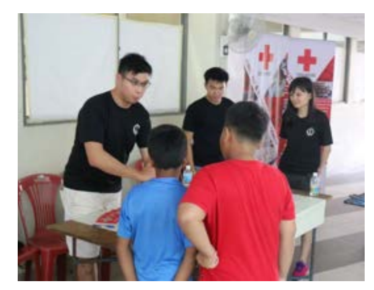
Picture 14 (left): Volunteers explaining to the children the importance of first aid