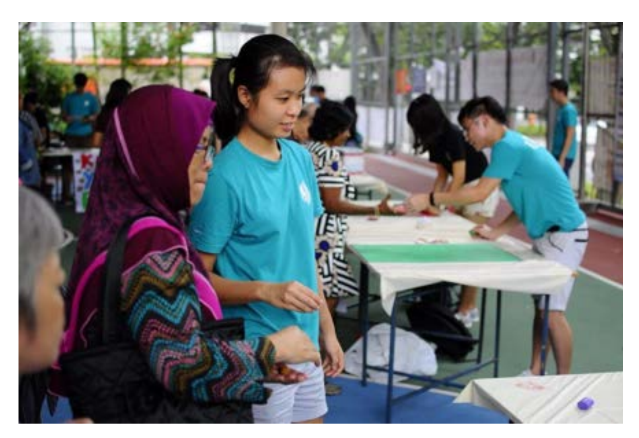
Picture 12 (above): Volunteers engaging the families in throwing the balls into the slots