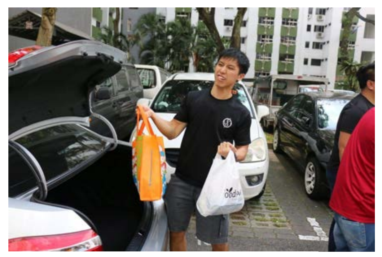
Picture 23 and 24 (above and below): Volunteers on the way out to deliver the food packs