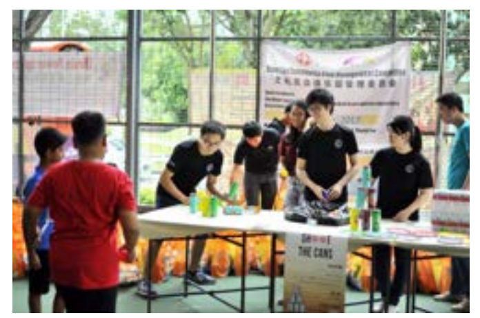
Picture 5 (left): Volunteers engaging the families about the importance of healthy living via games