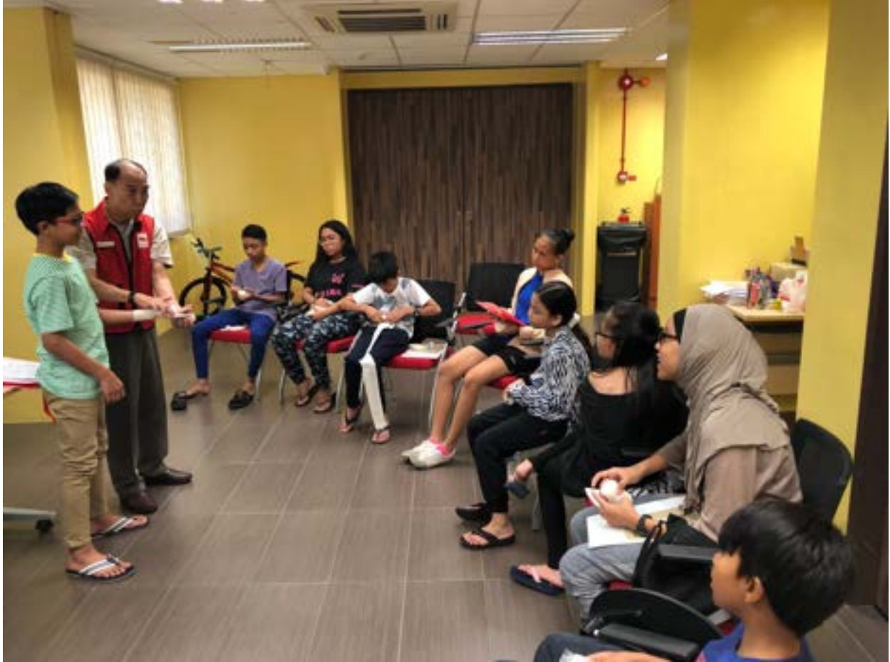
At the end of the workshop, a recap is given to wrap up the day as well as emphasizing crucial techniques of first aid.