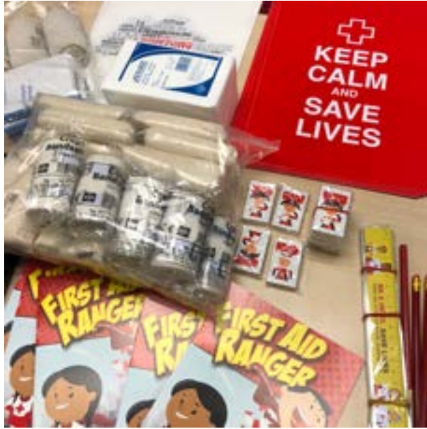
Teaching tools include: Crepe Bandage, Triangular bandage, First aid handbook, alcohol swaps etc.