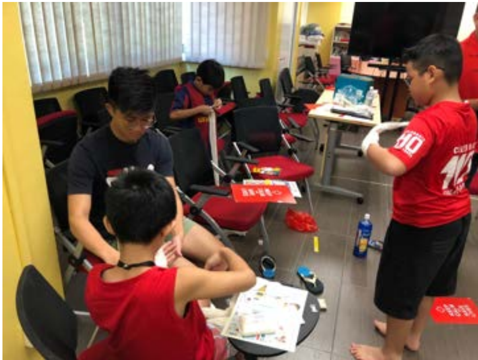
Our very own student coach in action, assisting students with their bandaging.