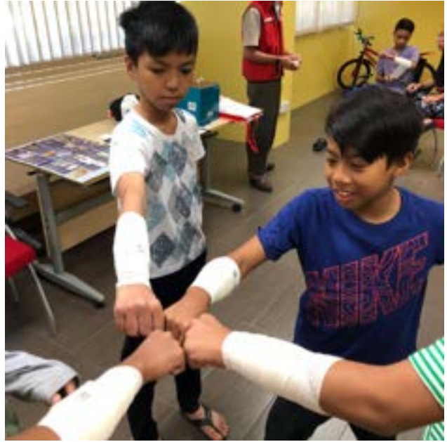
Students proudly presenting their very own handiwork – a pressure bandage for wound and bleeding control.