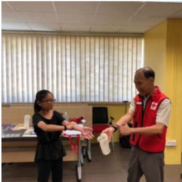
Student attempting a first aid revision quiz (top). Our friendly Red Cross coach demonstrating the application of crepe bandage for the wound management class (left).