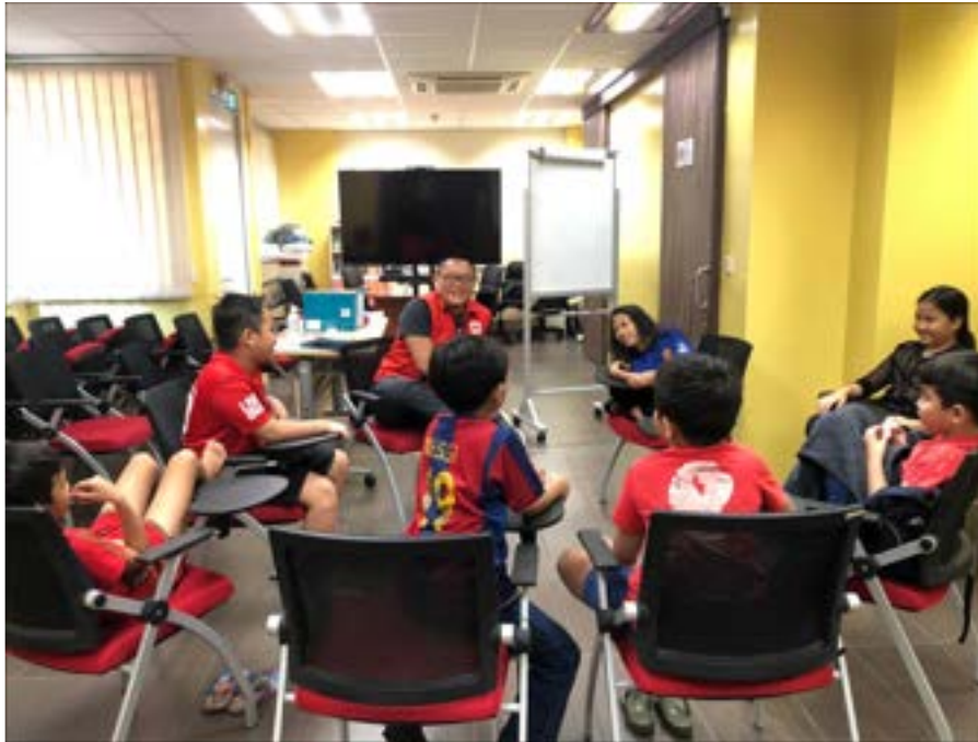
Ice Breaking activities with the mentor (top) for students from lower primary levels, and introduction to first aid (bottom).