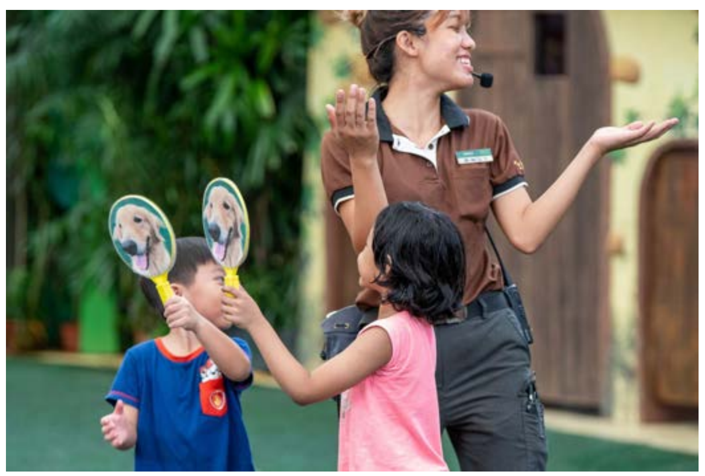
Golden retrievers – the most popular at the Animal Friends show