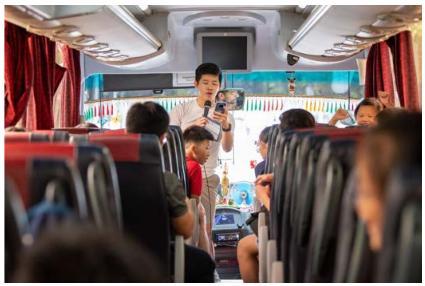
Briefing on the bus