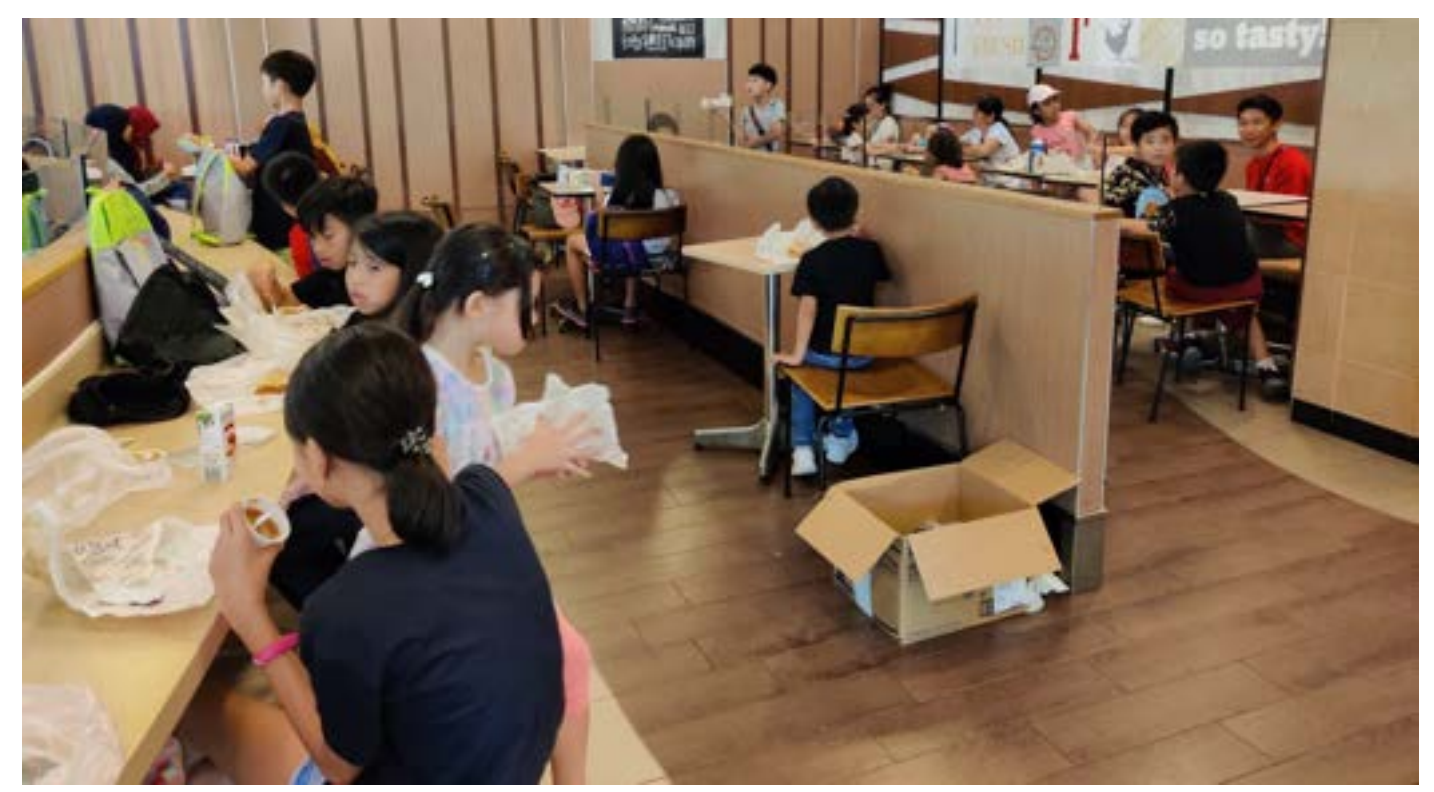
Lunch at KFC