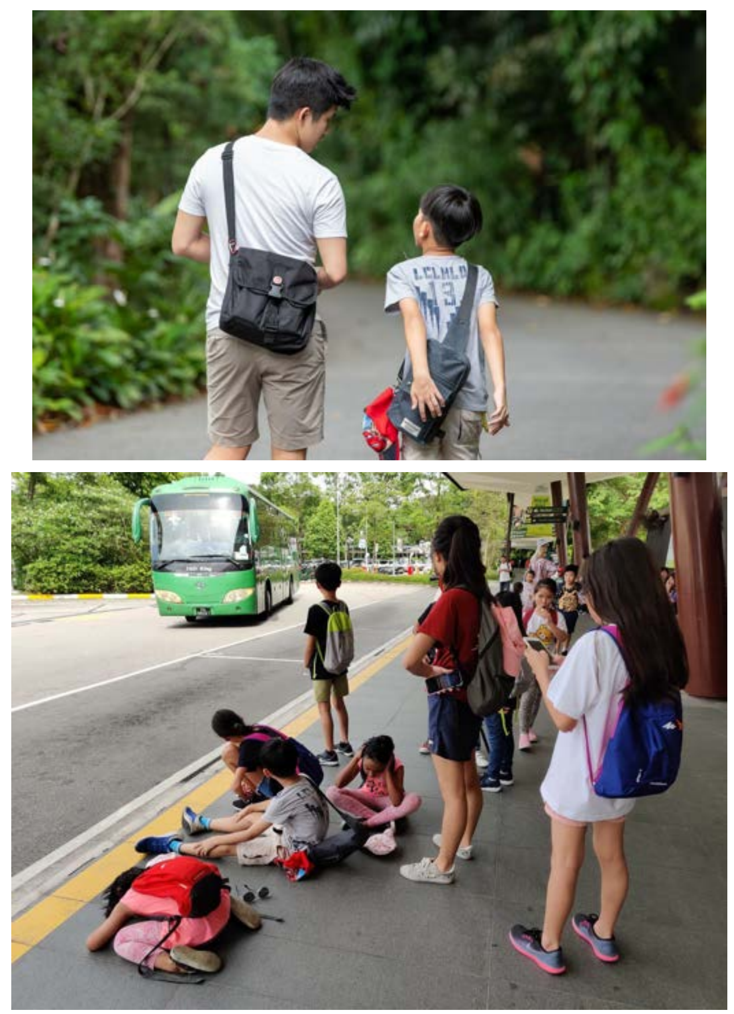
All ready to go home