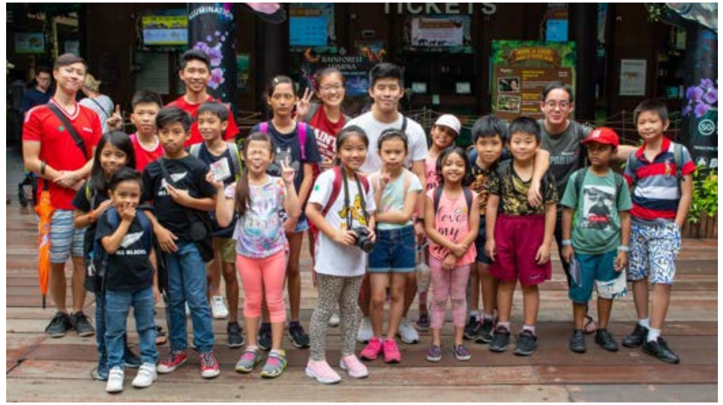
Arrival at the Zoo