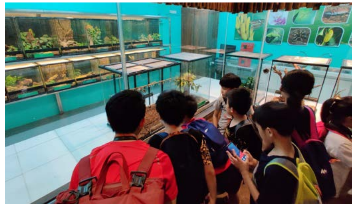
Looking for the stick insect...