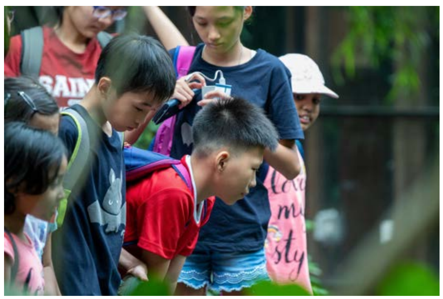
Searching for otters