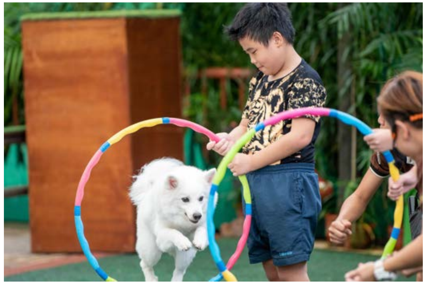
Some of our kids became part of the show!