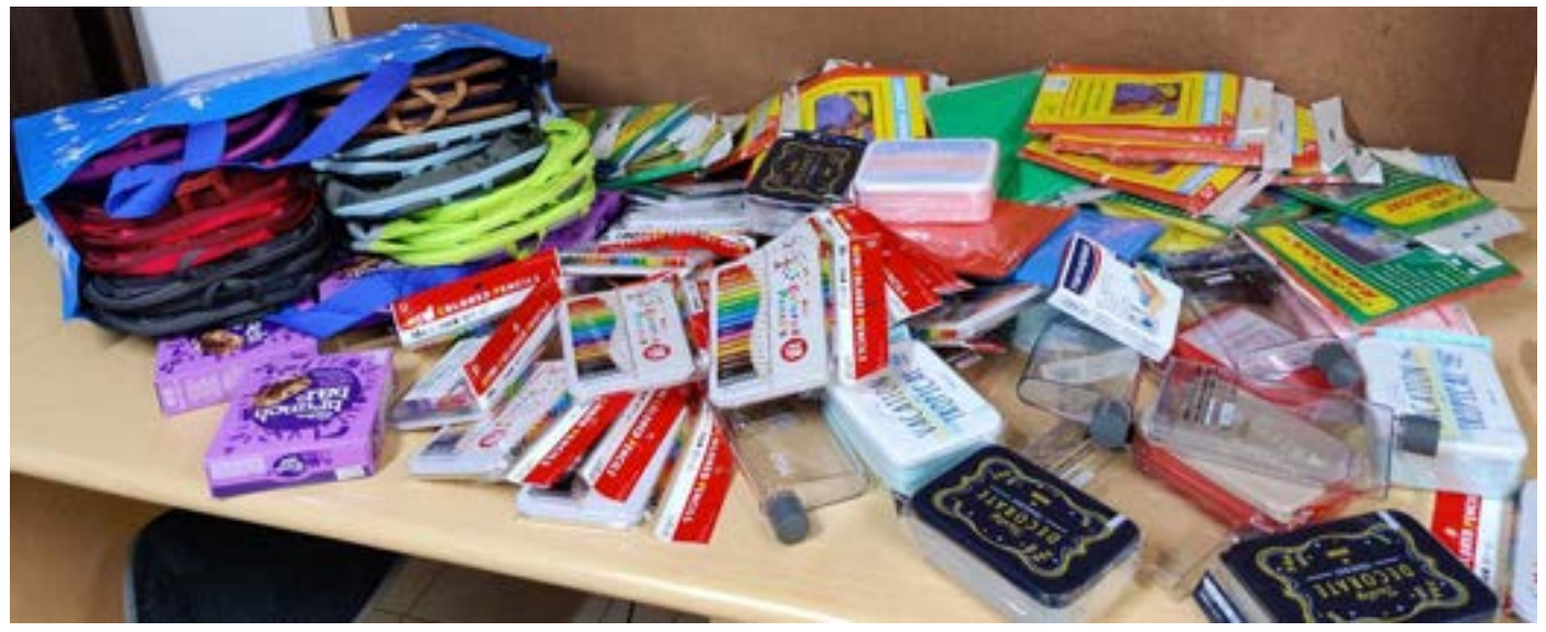
Preparing the gift bags for the kids