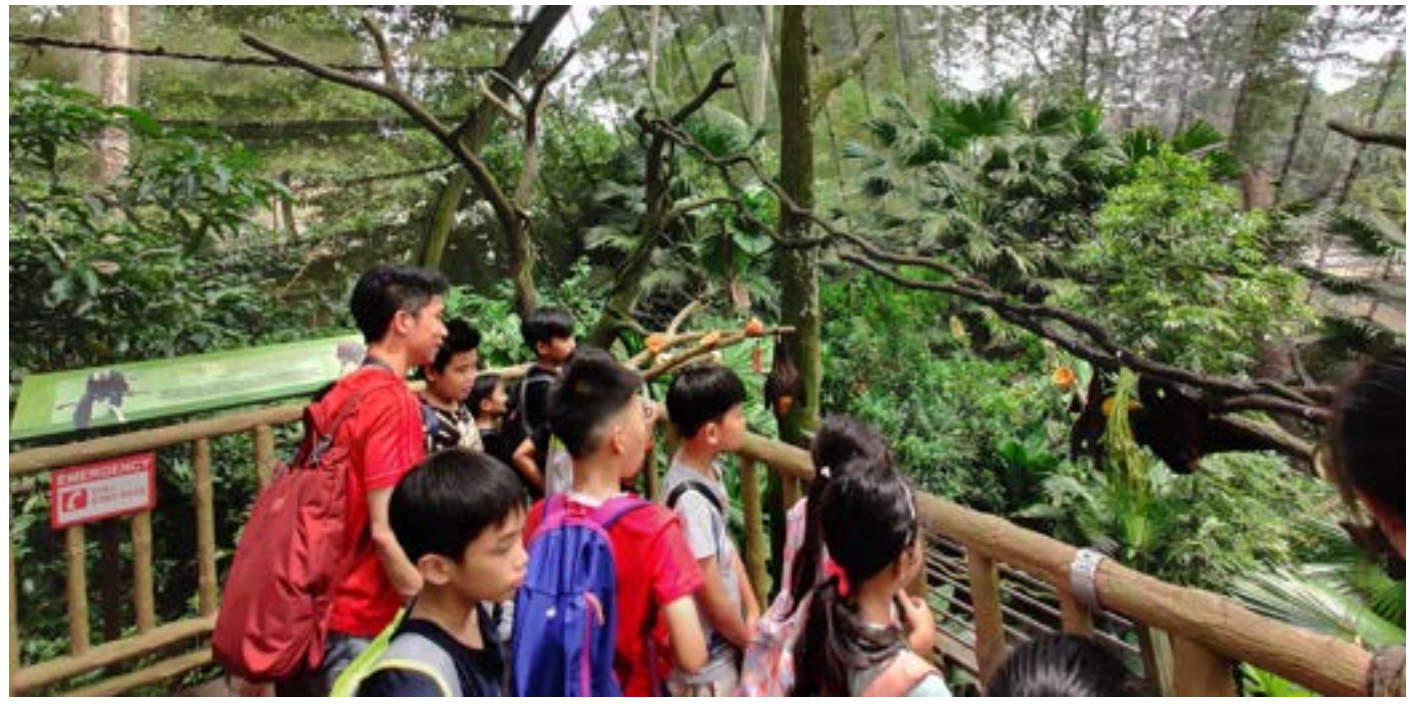
Observing vampire bats up close