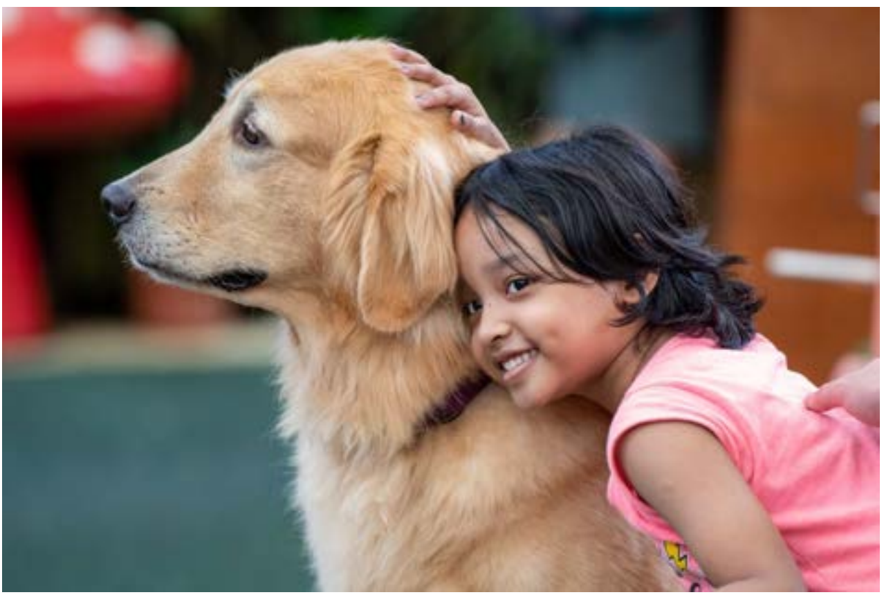
Shot of the day