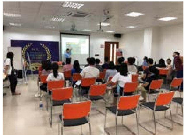
Figure 6. Lectures on environmental issues in Mekong delta conducted by renowned experts.