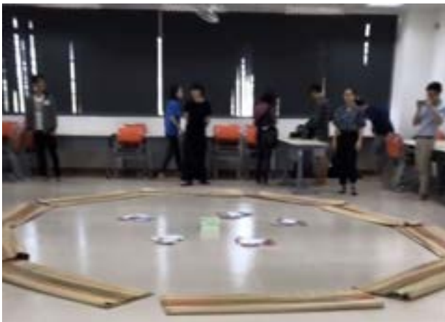
Figure 5. Preparing for empathy exercises