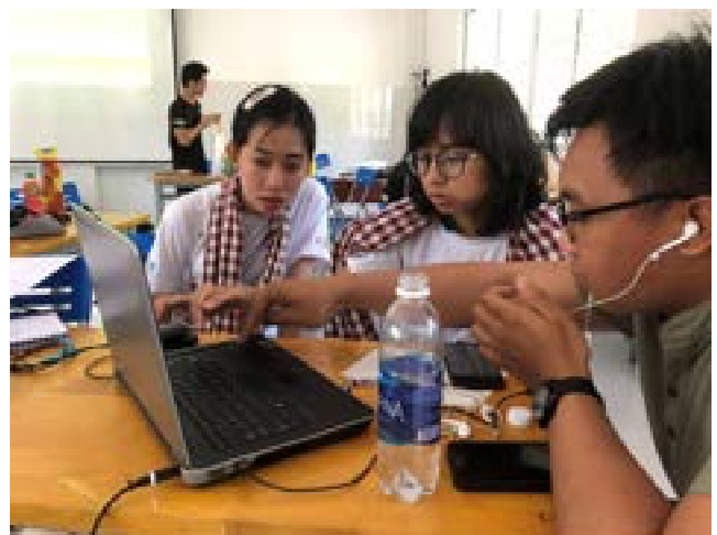
Figure 15 - 20. Post production. Time to tidy up the videos!