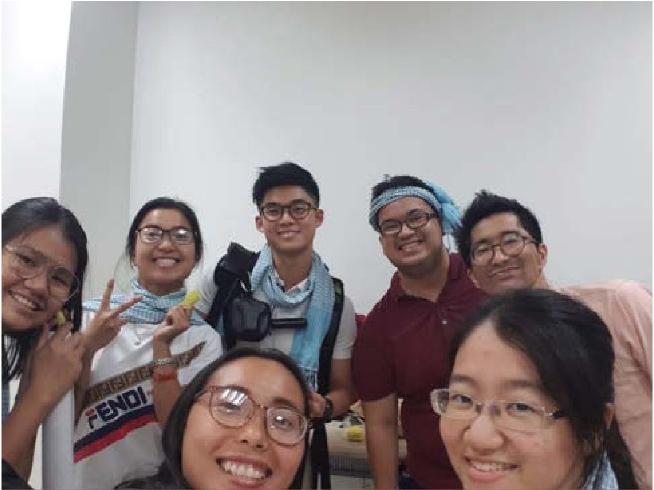
Figure 29. My beloved team.