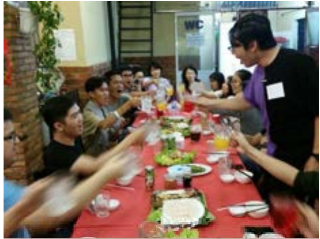
Figure 3&4. Dinner at a restaurant on day 0. Getting hyped up for our amazing time together!