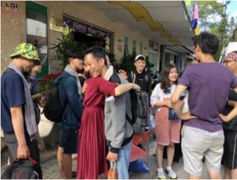
Figure 27. Time to bid farewell. BUT it's not a goodbye, it's a "see you soon" .