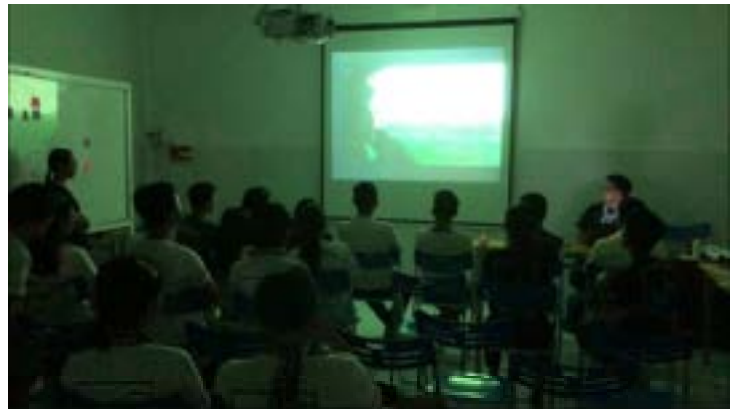
Figure 21&22: Showcase time.