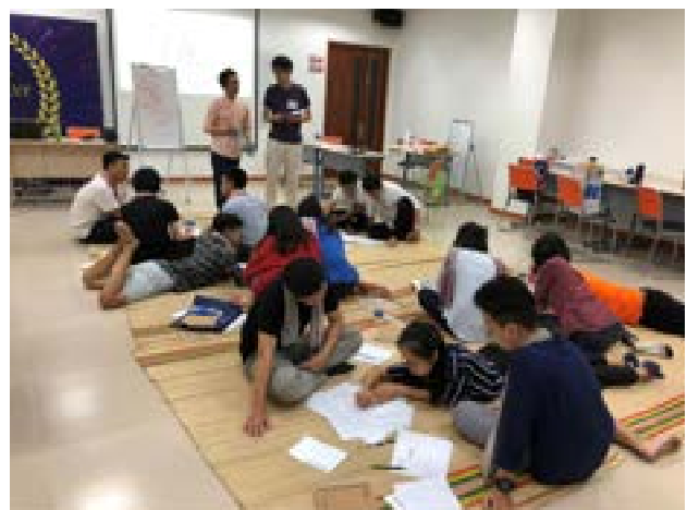
Figure 8. Planning storyboard.