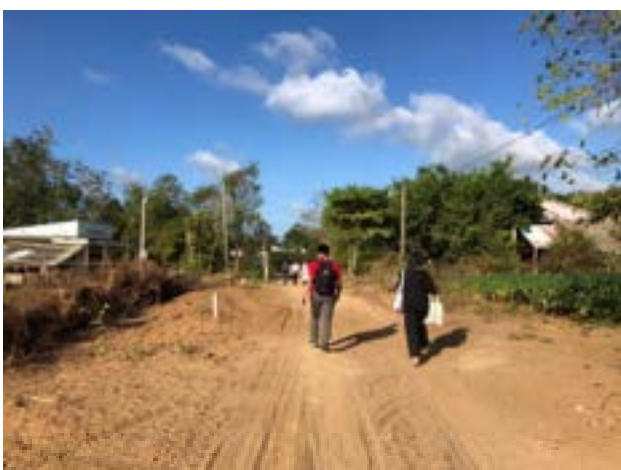
Figure 13. Teams split ways to visit the locals and learn about their stories.