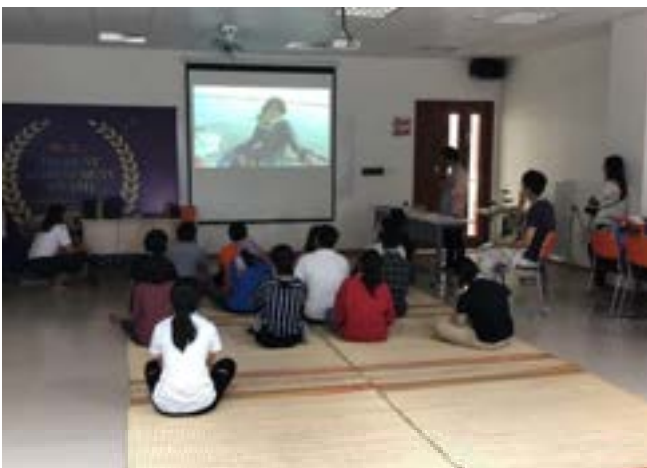
Figure 7. Before you make videos, you got to watch videos.