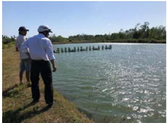
Figure 9,10,11&12. Village near the coast of Tra Vinh city. Wide varieties of crops grown here from rice to vegetables to shrimps. You can tell that the area is really dry, mud cracks are omnipresent.