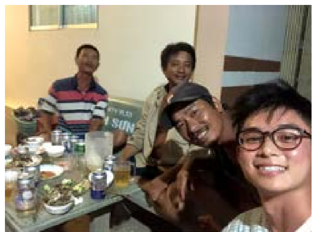
Figure 14. They treated us to some food and beer at the end of the day.