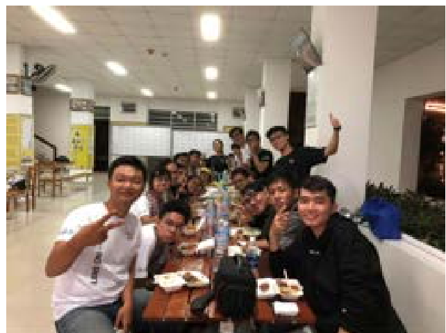
Figure 23 - 26. End of workshop. Look at all those happy faces!