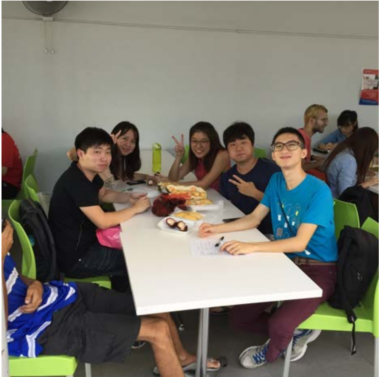
Let's tuck in