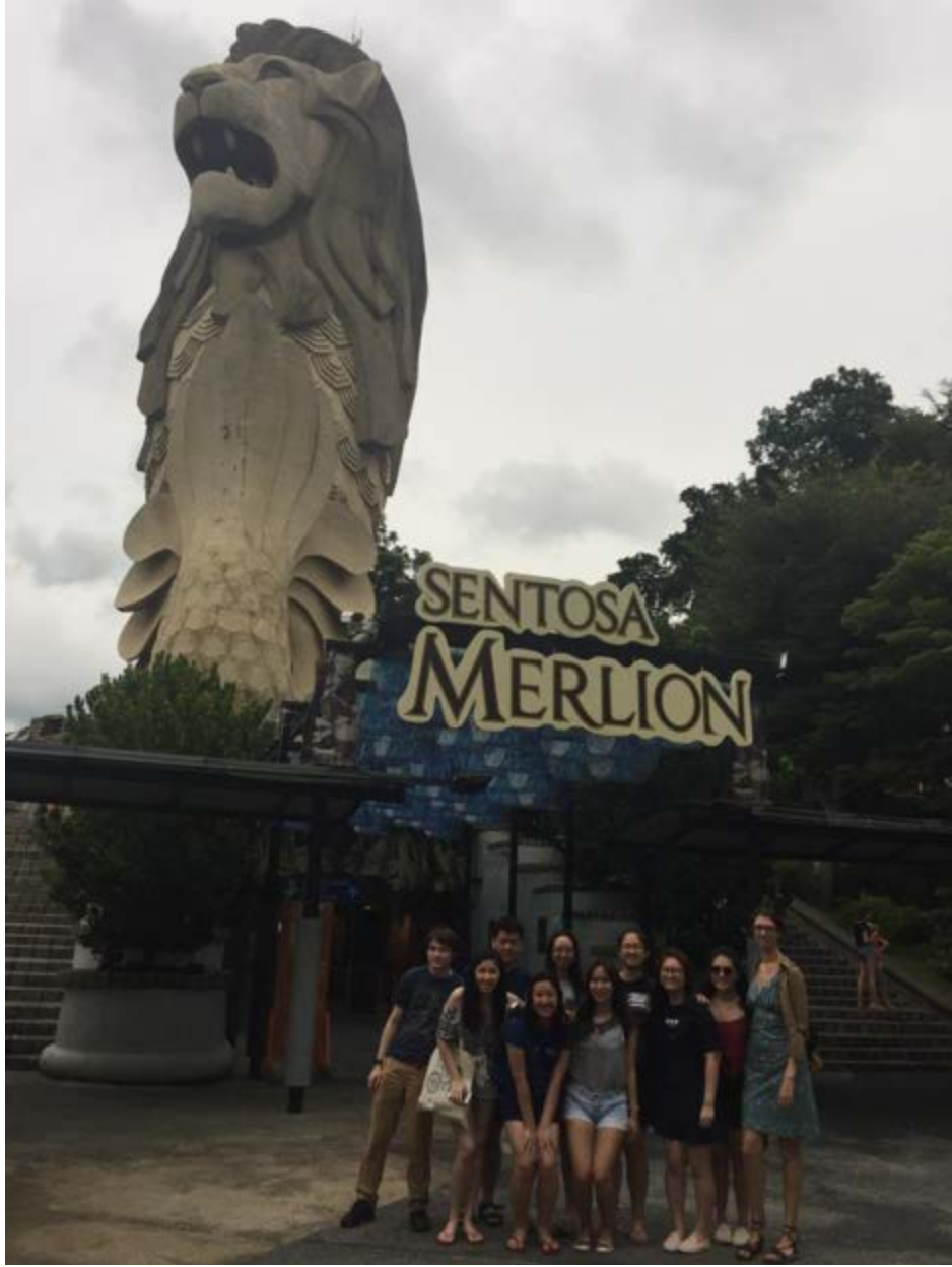
A picture at the Merlion