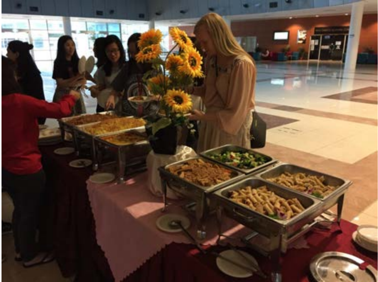
Starting the farewell dinner