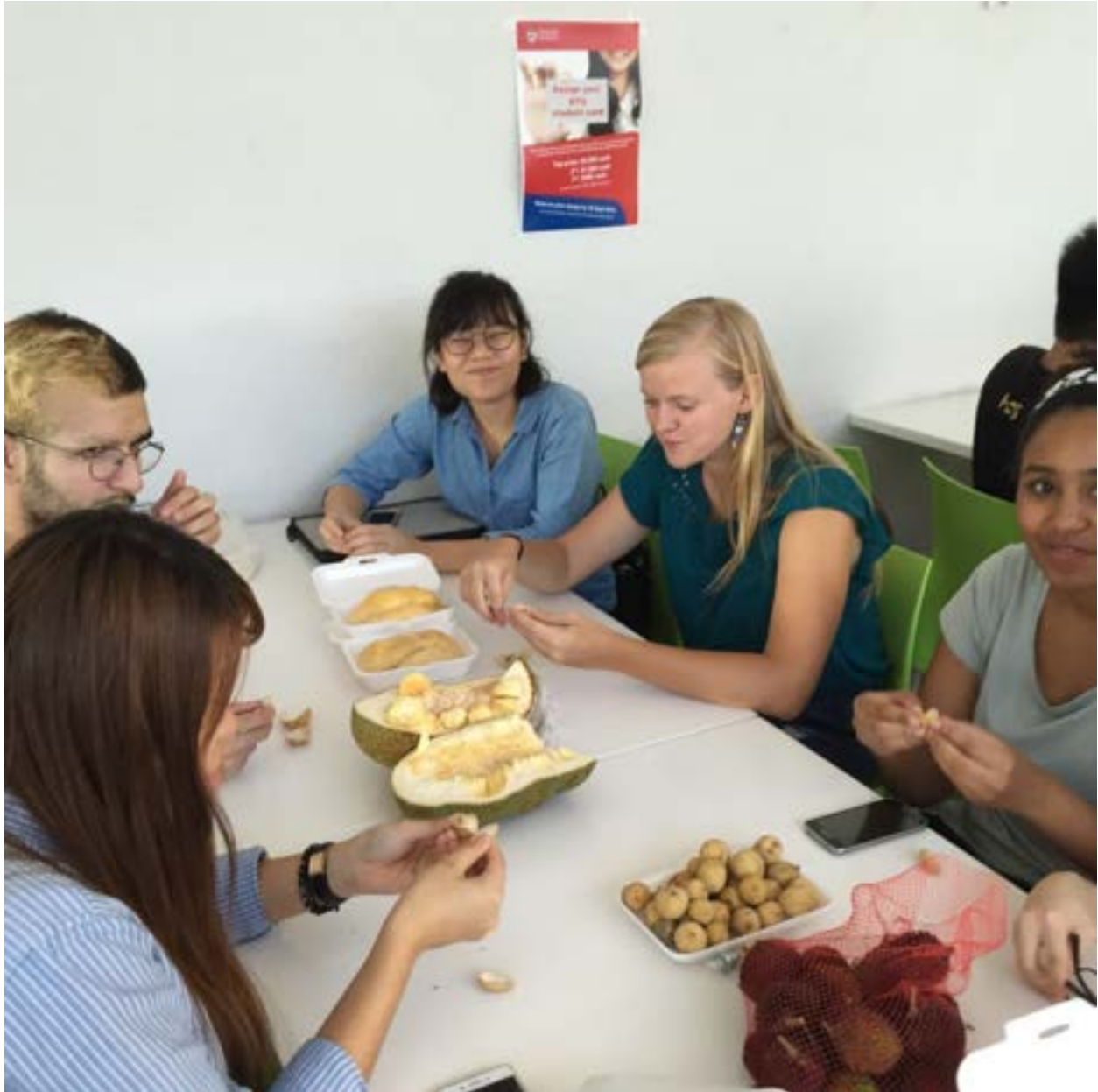
Tropical fruits tasting session is starting

The purpose of this session is for international students to try local tropical fruits (Durian, jackfruit, putusan, long kong, etc).