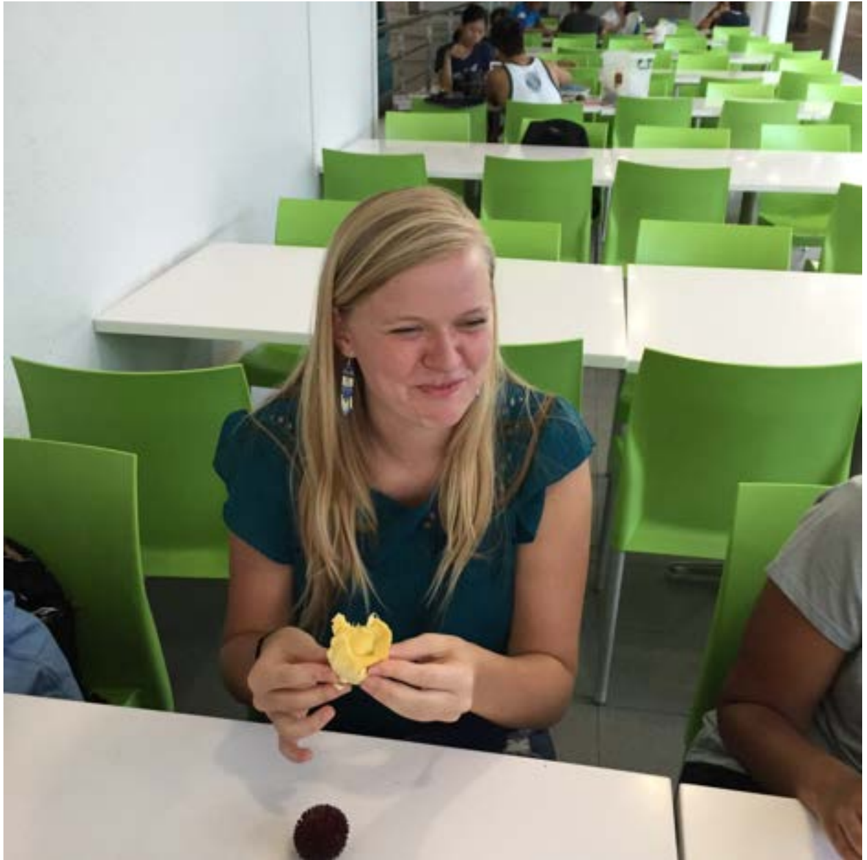
The durian tastes good