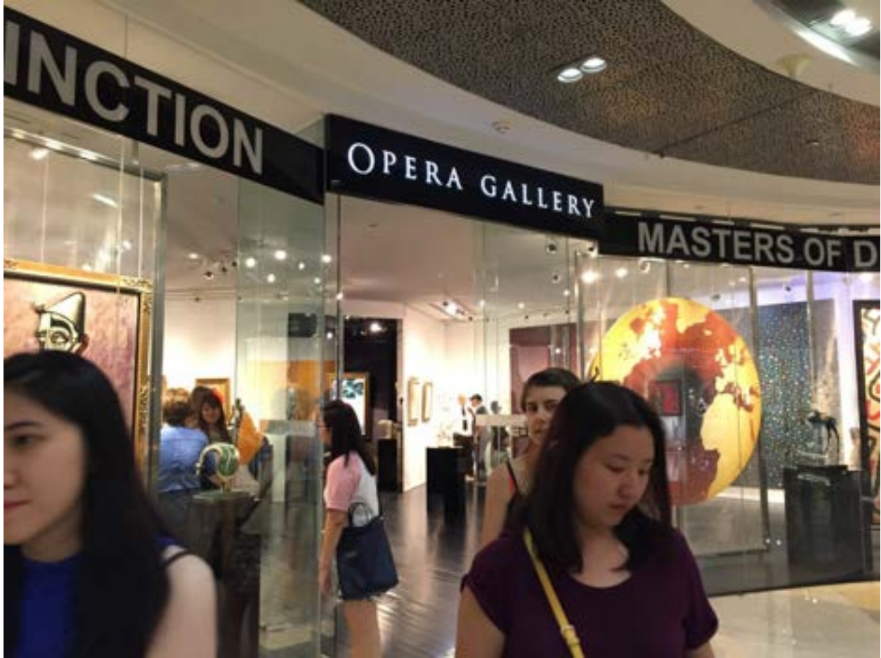
Visiting the Opera Gallery in ION Orchard