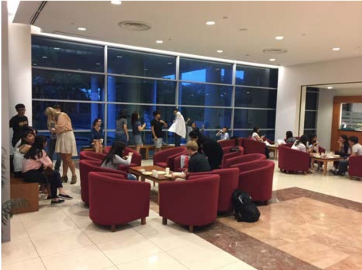
Buddies interacting with one another