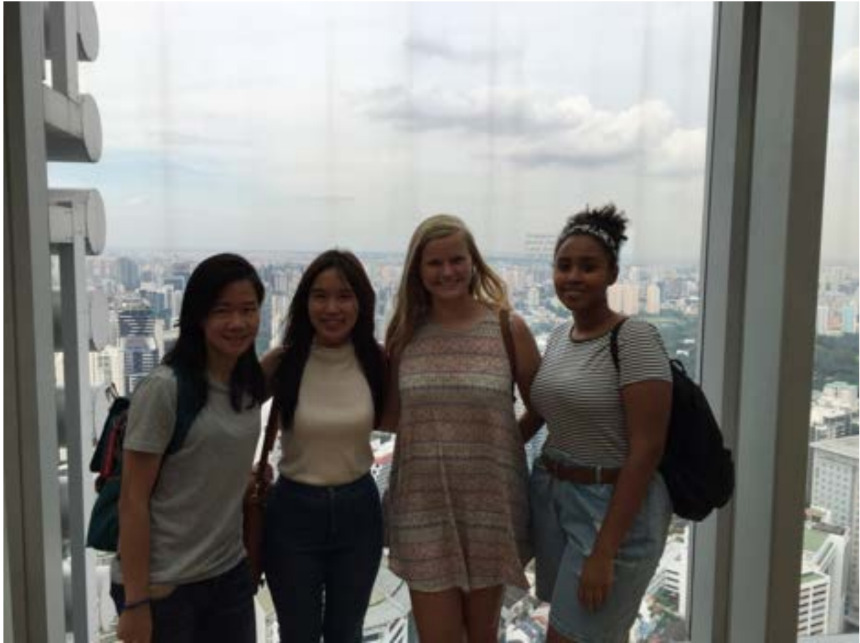
A picture for the buddies