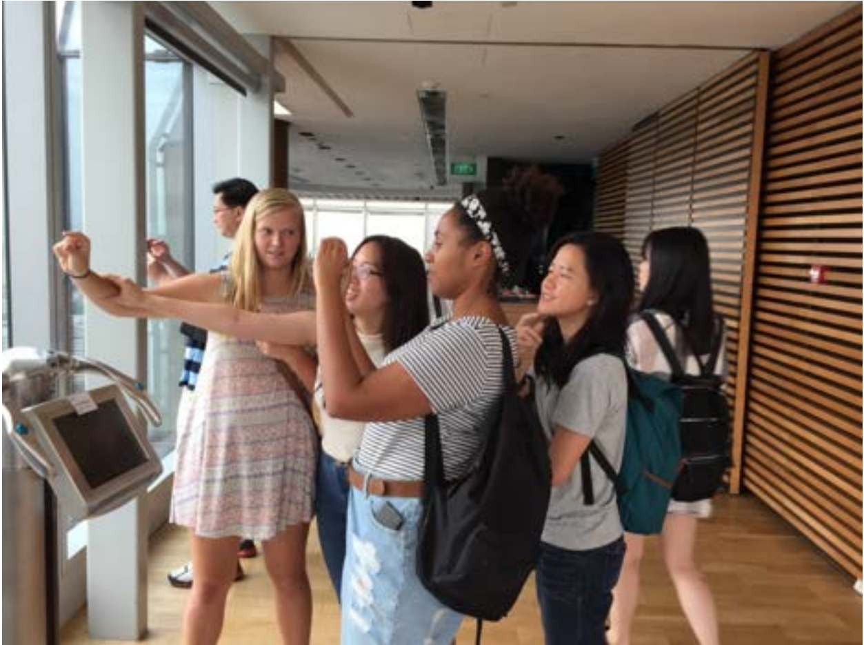
Welcome to ION Sky Orchard

The purpose of this trip is for international students to get to know more about Singapore's Central Business District.