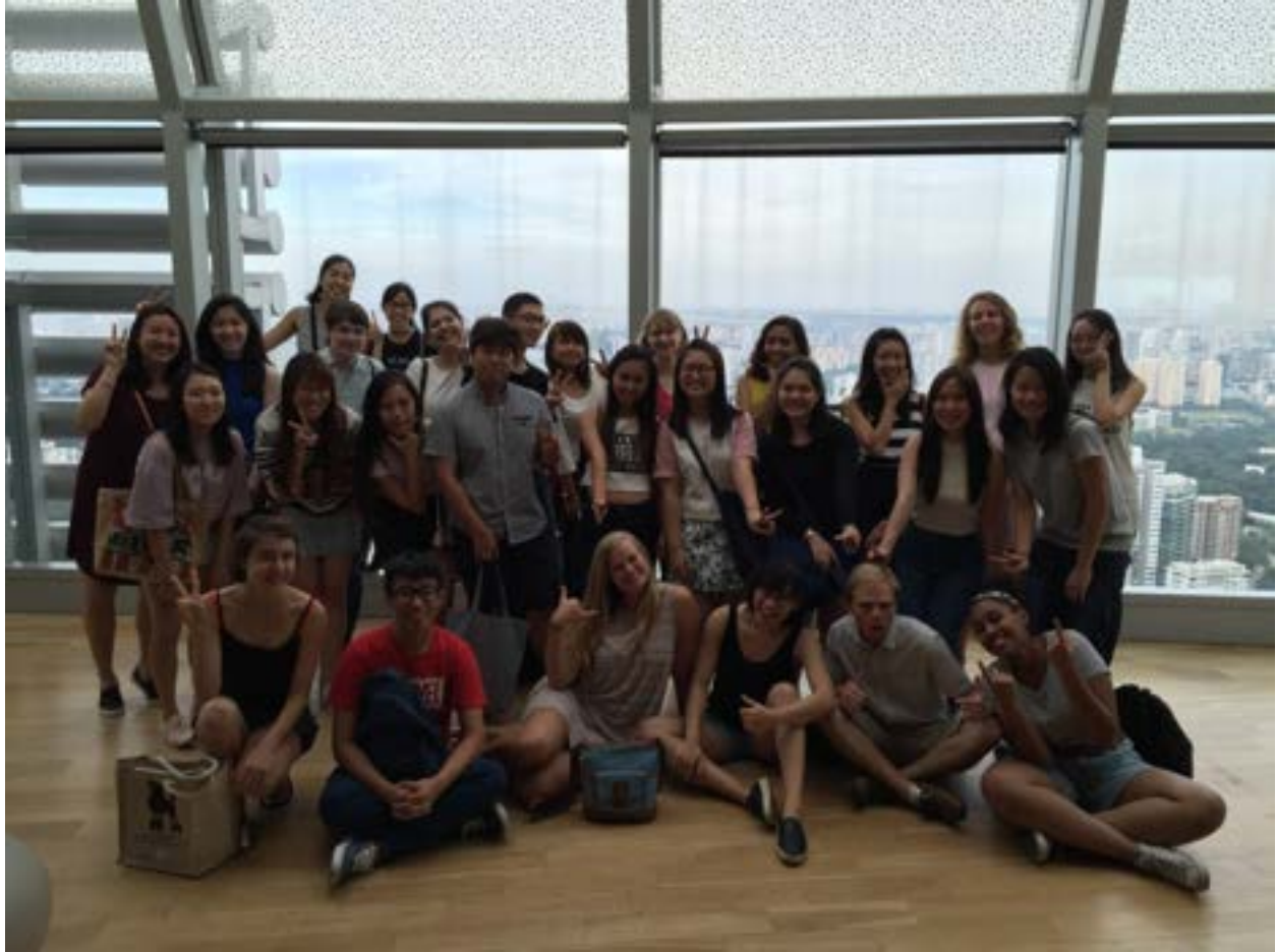
The end of our Orchard Road trip