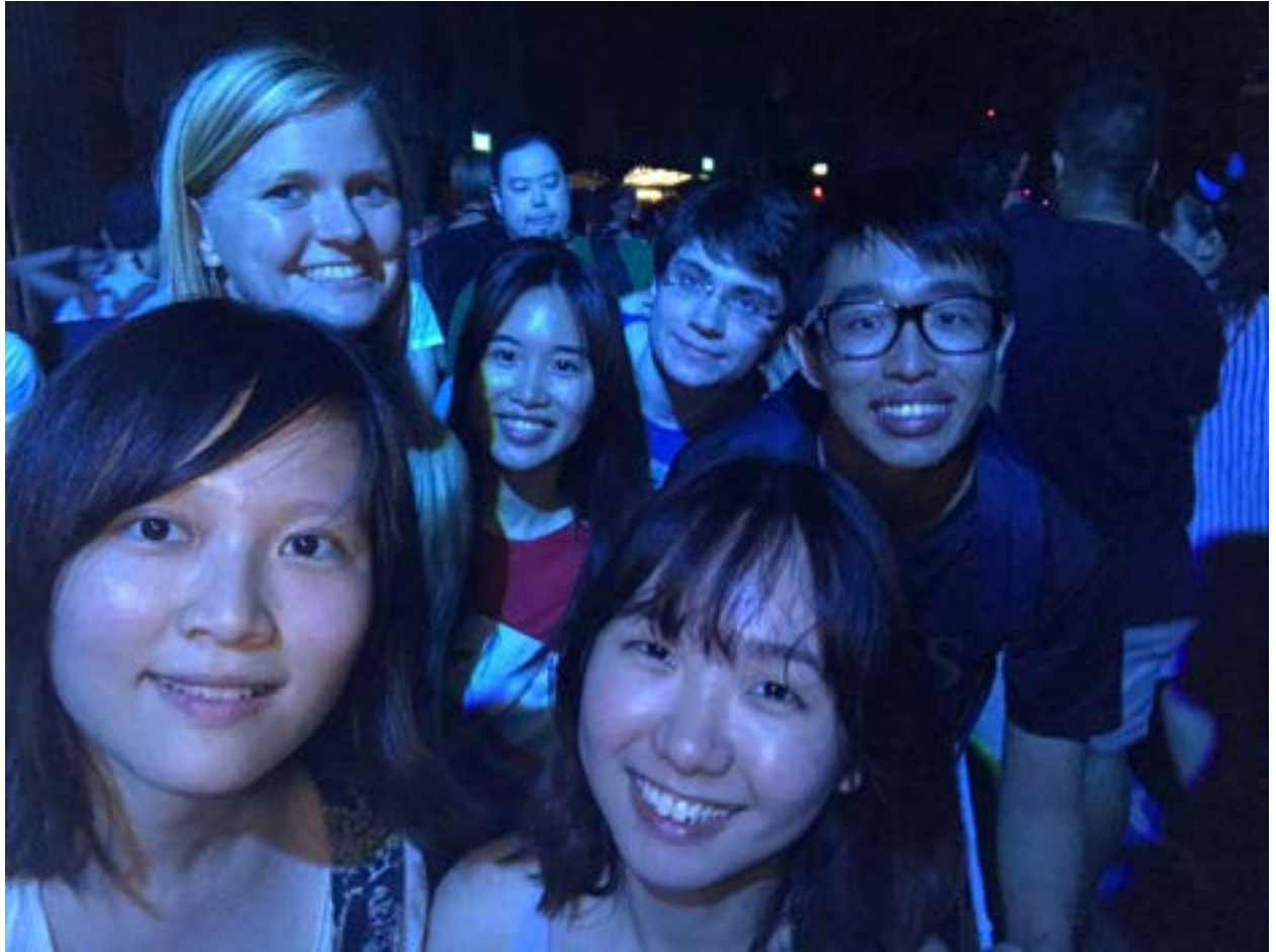
Buddies celebrating Halloween together