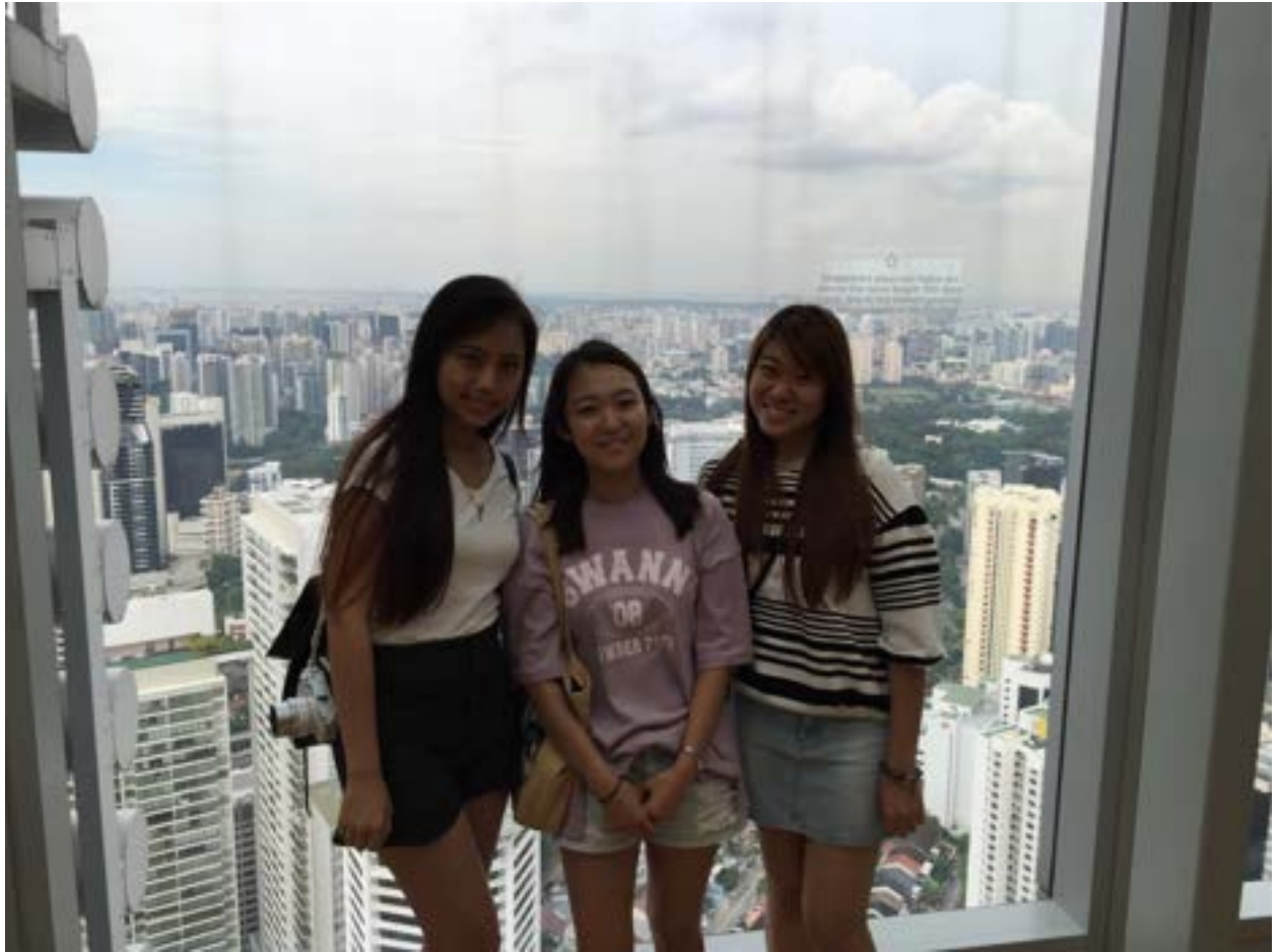
Another picture for the buddies