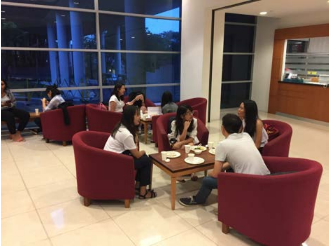
Buddies interacting with one another