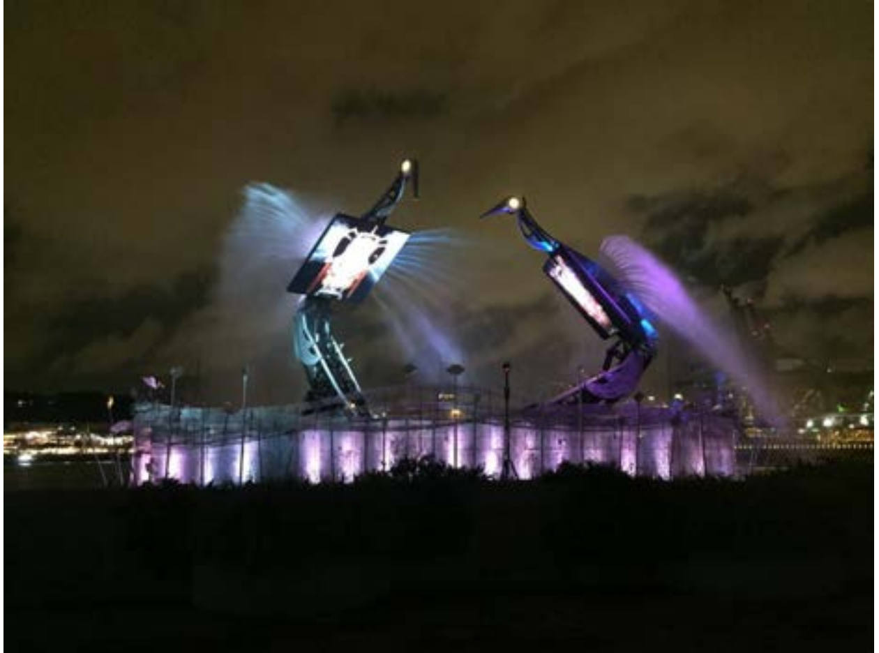
Watching crane dance performance