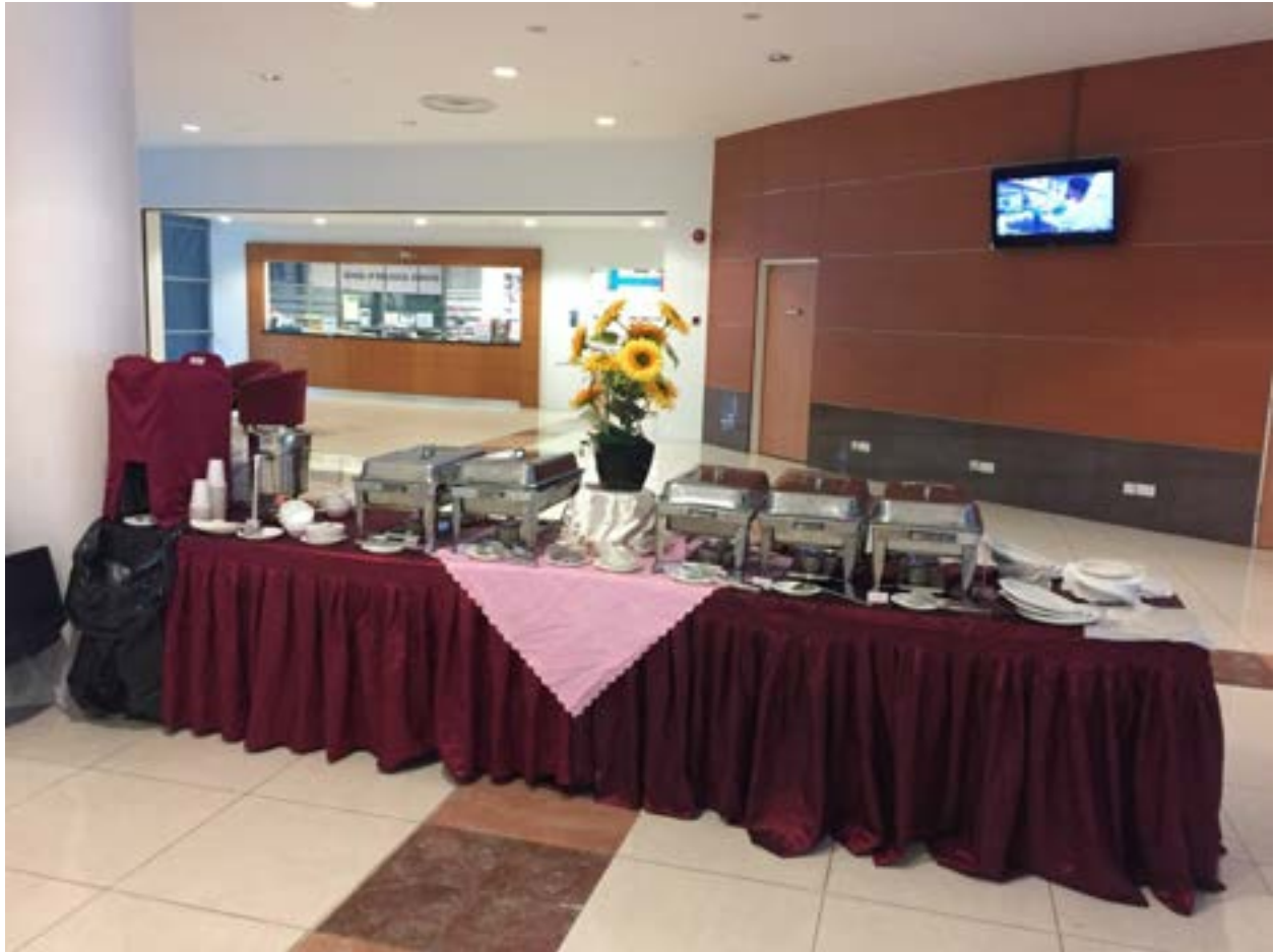
Getting ready for the farewell dinner