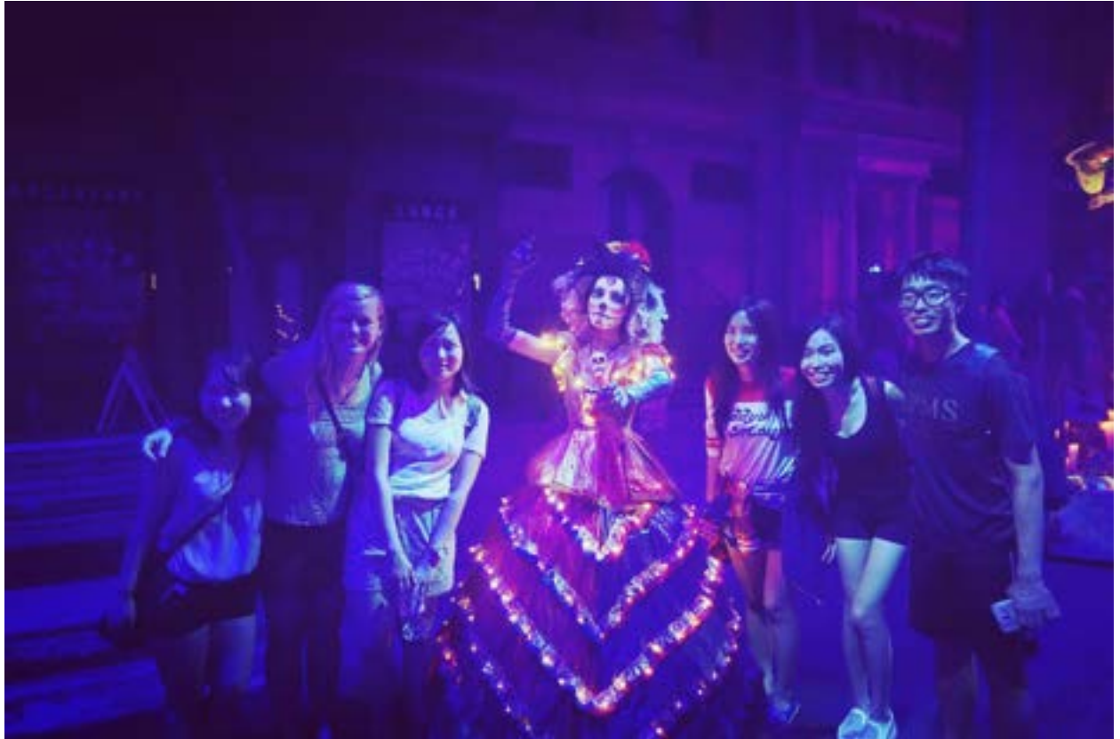
Buddies celebrating Halloween together