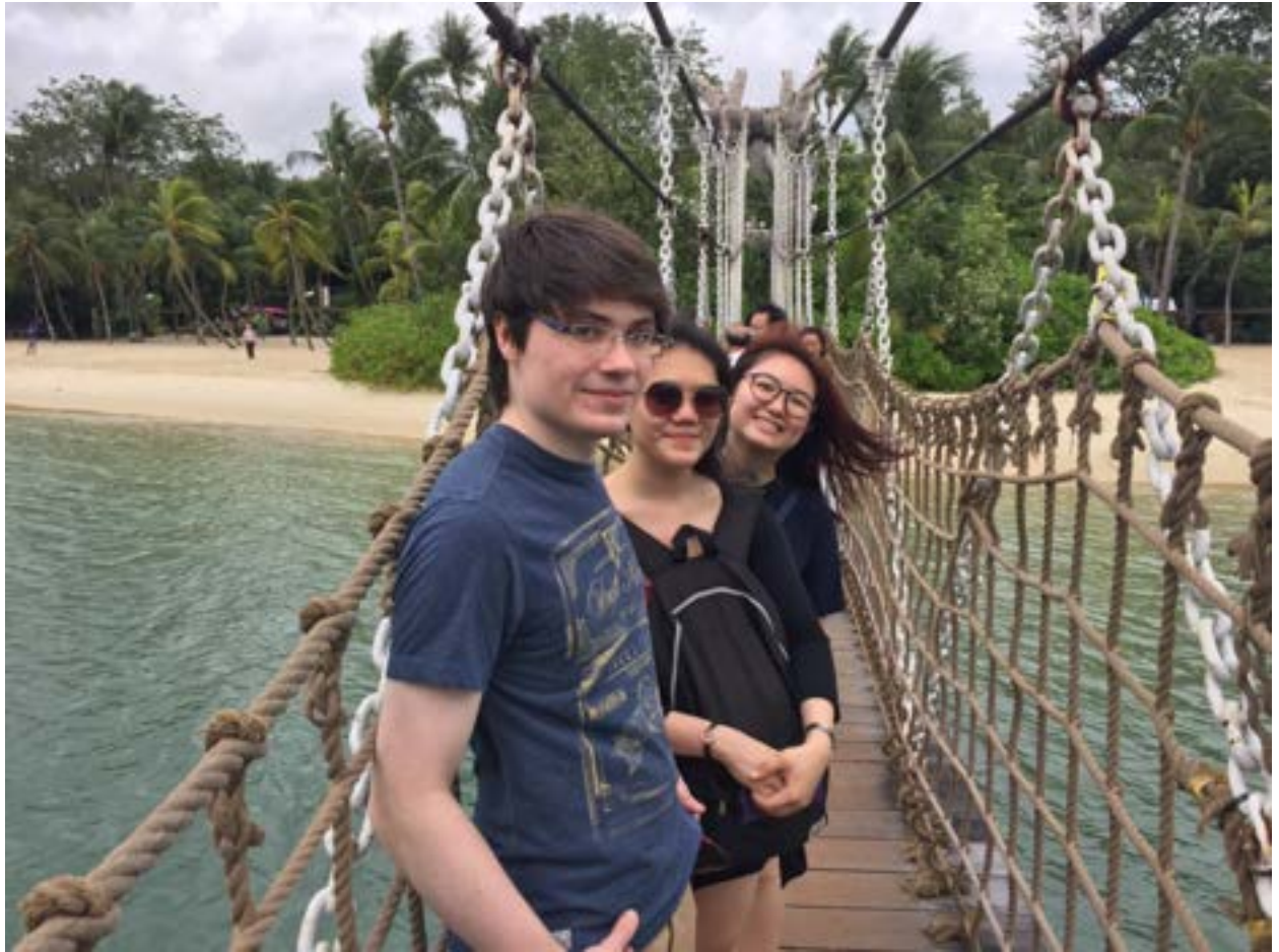
Visiting Sentosa Beaches