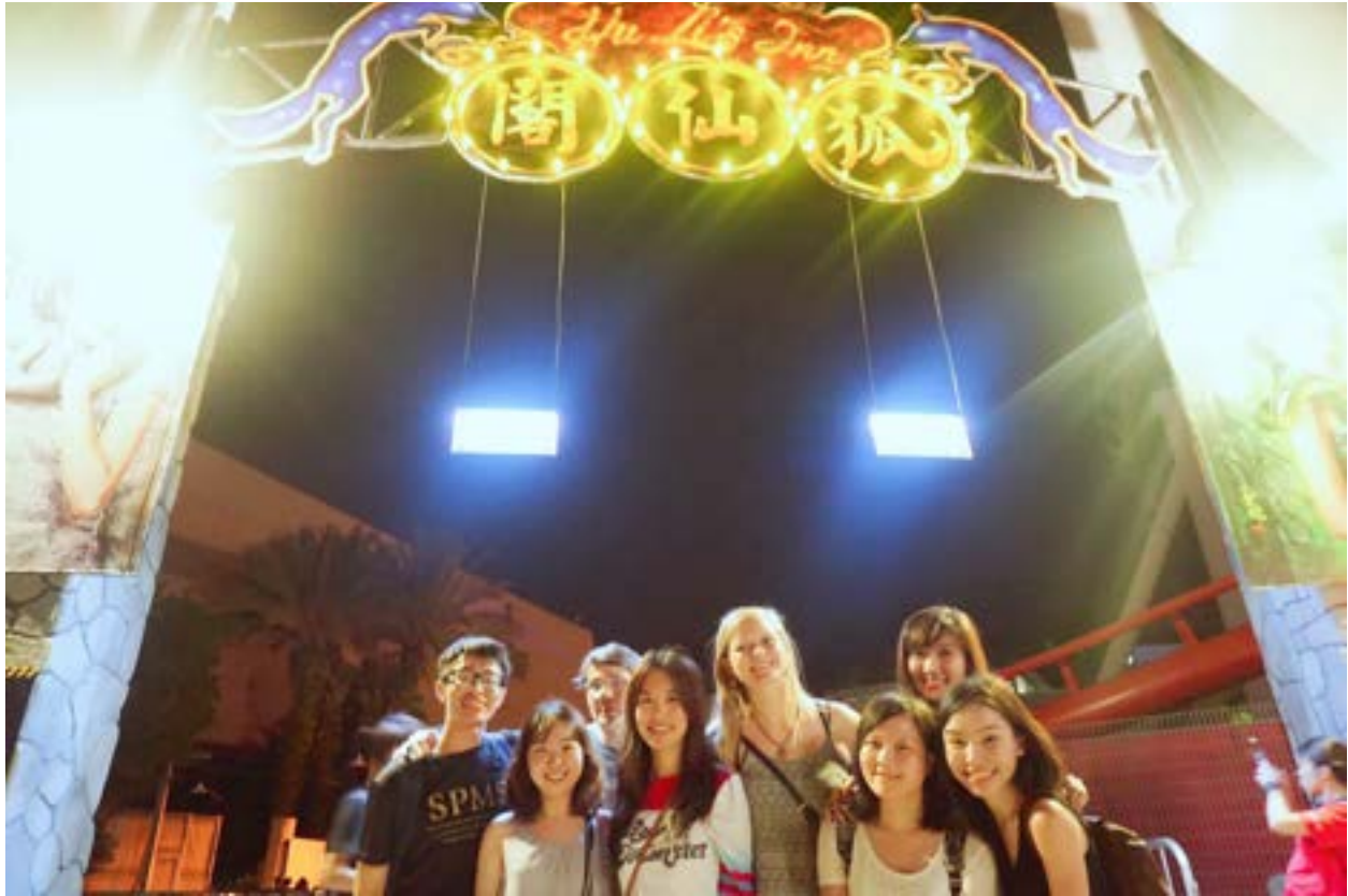
Buddies celebrating Halloween together