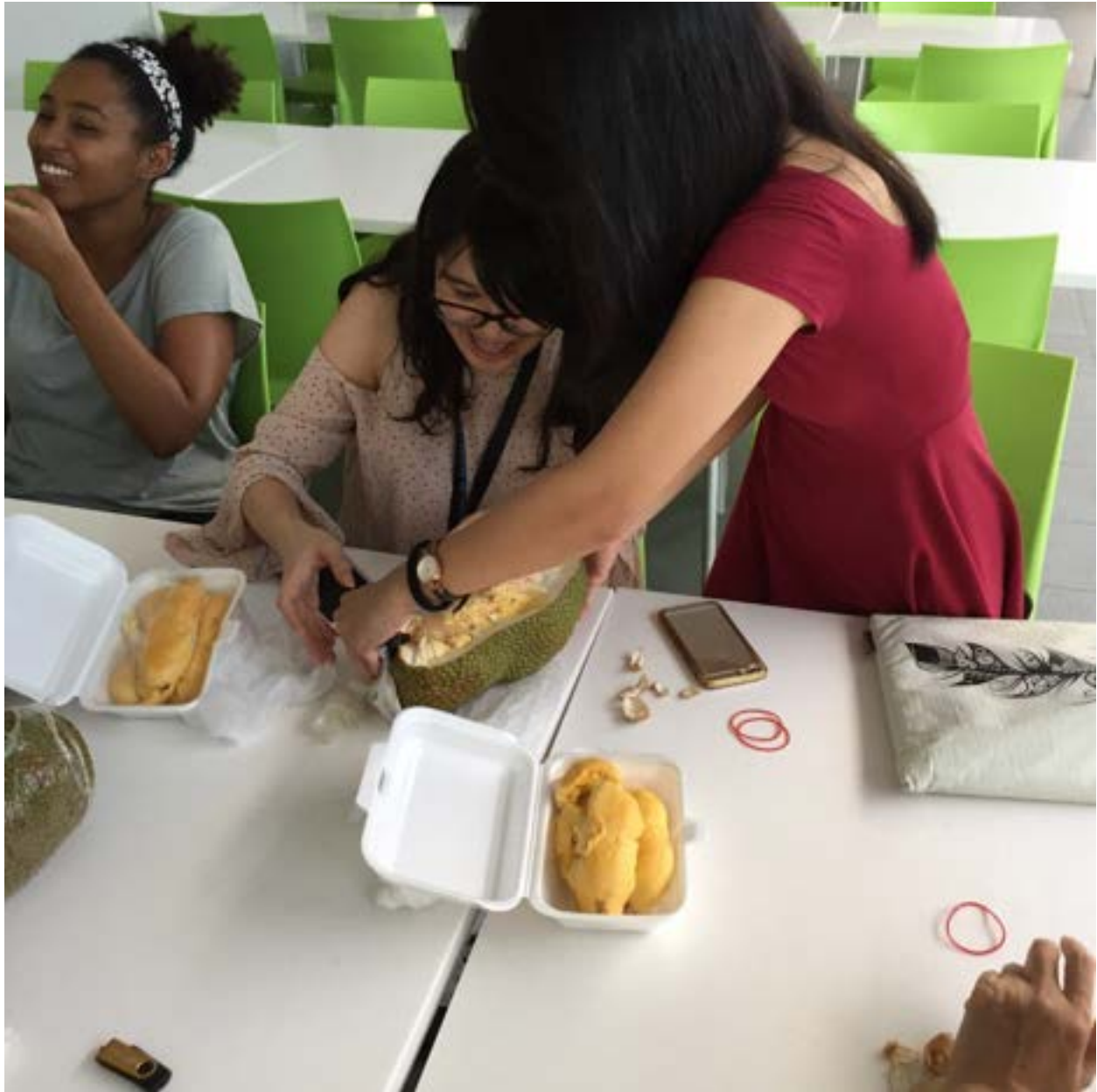
Opening a jackfruit