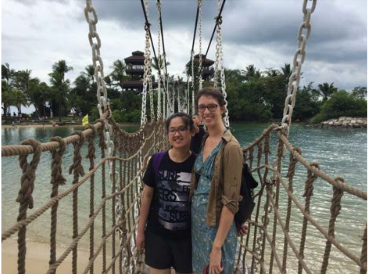
Visiting Sentosa Beaches

We brought international students to Sentosa beaches for picnic, local food and to watch Crane Dance performance.