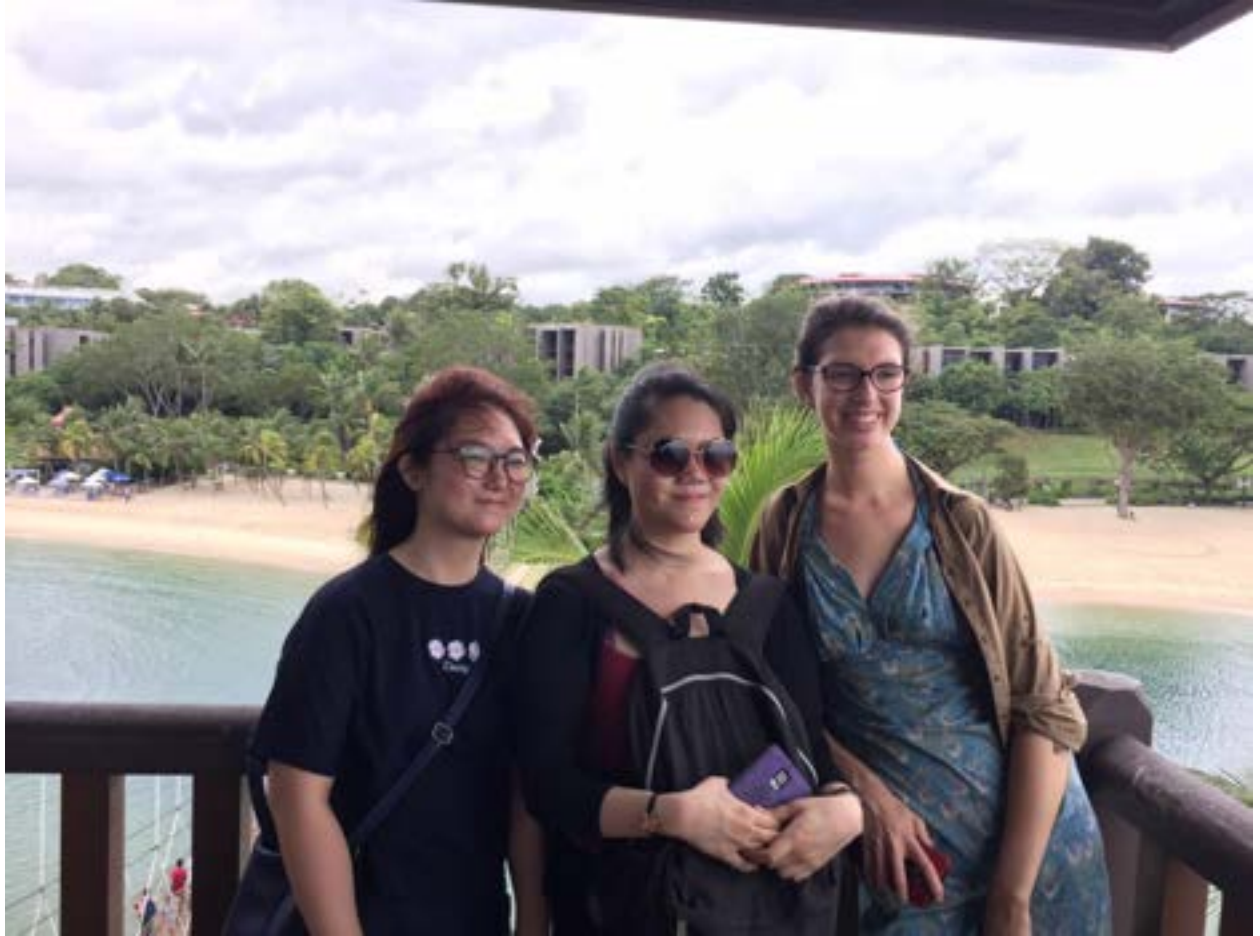
Visiting Sentosa Beaches