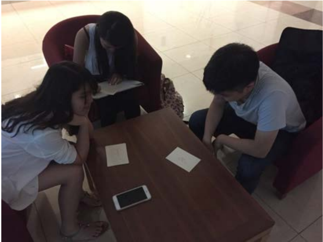
Buddies writing farewell messages to one another