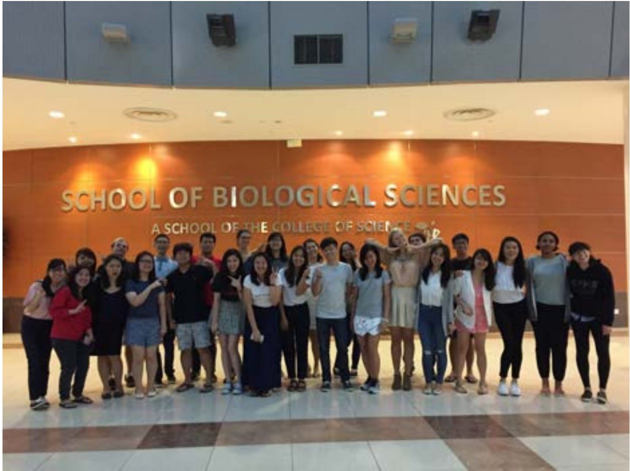
End of the farewell dinner