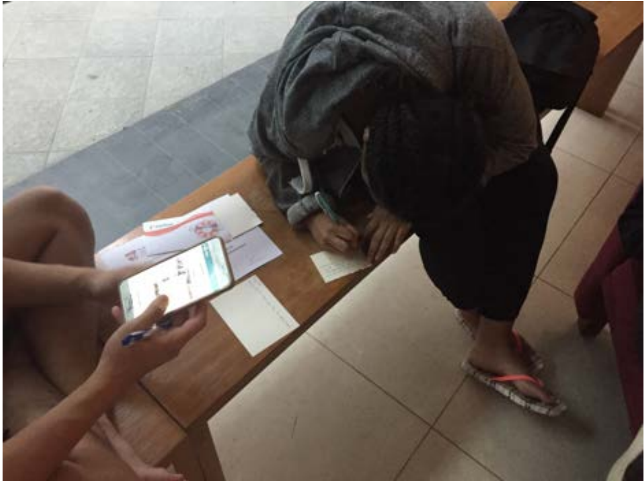
Buddies writing farewell messages to one another