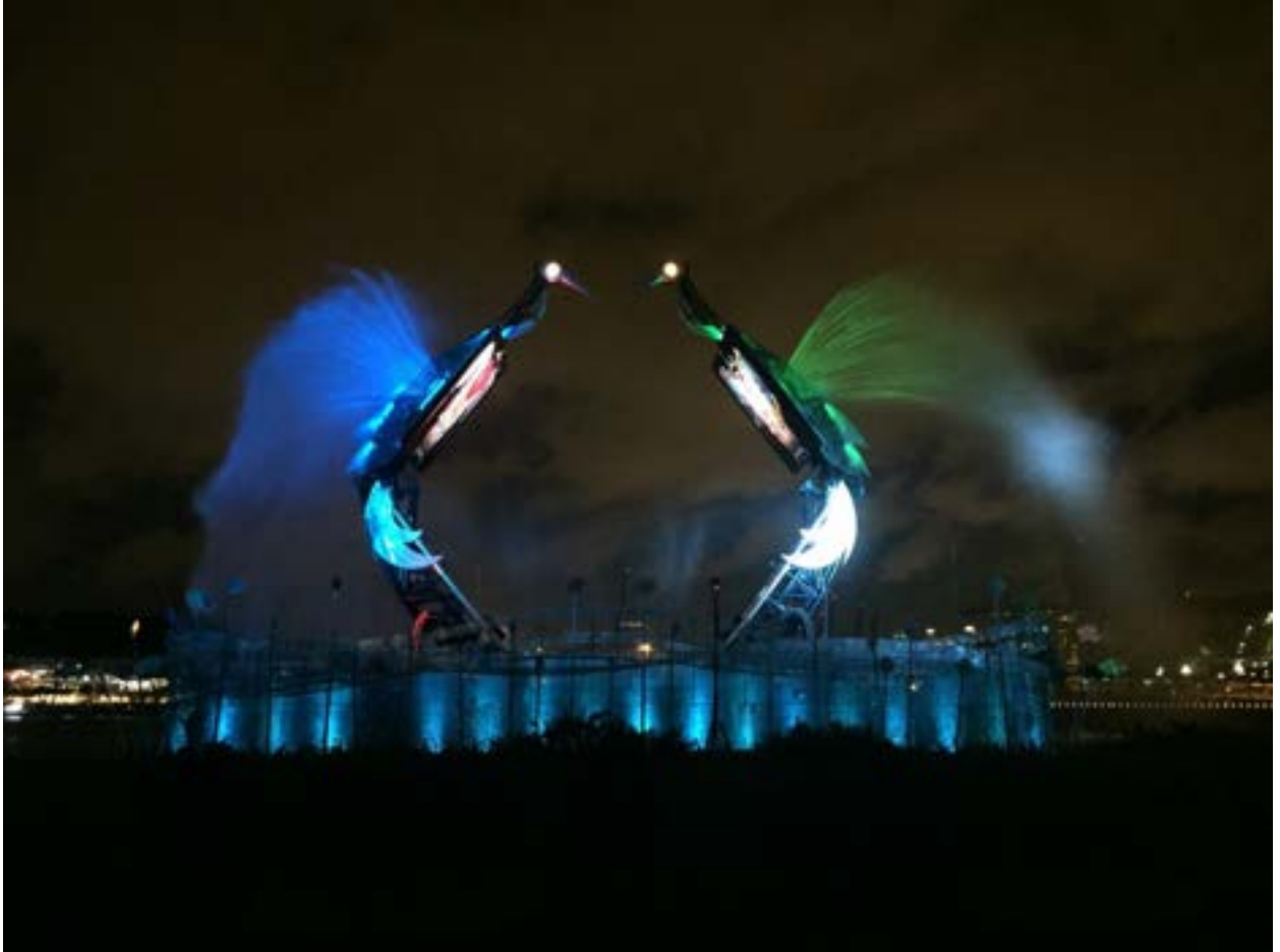
Watching crane dance performance