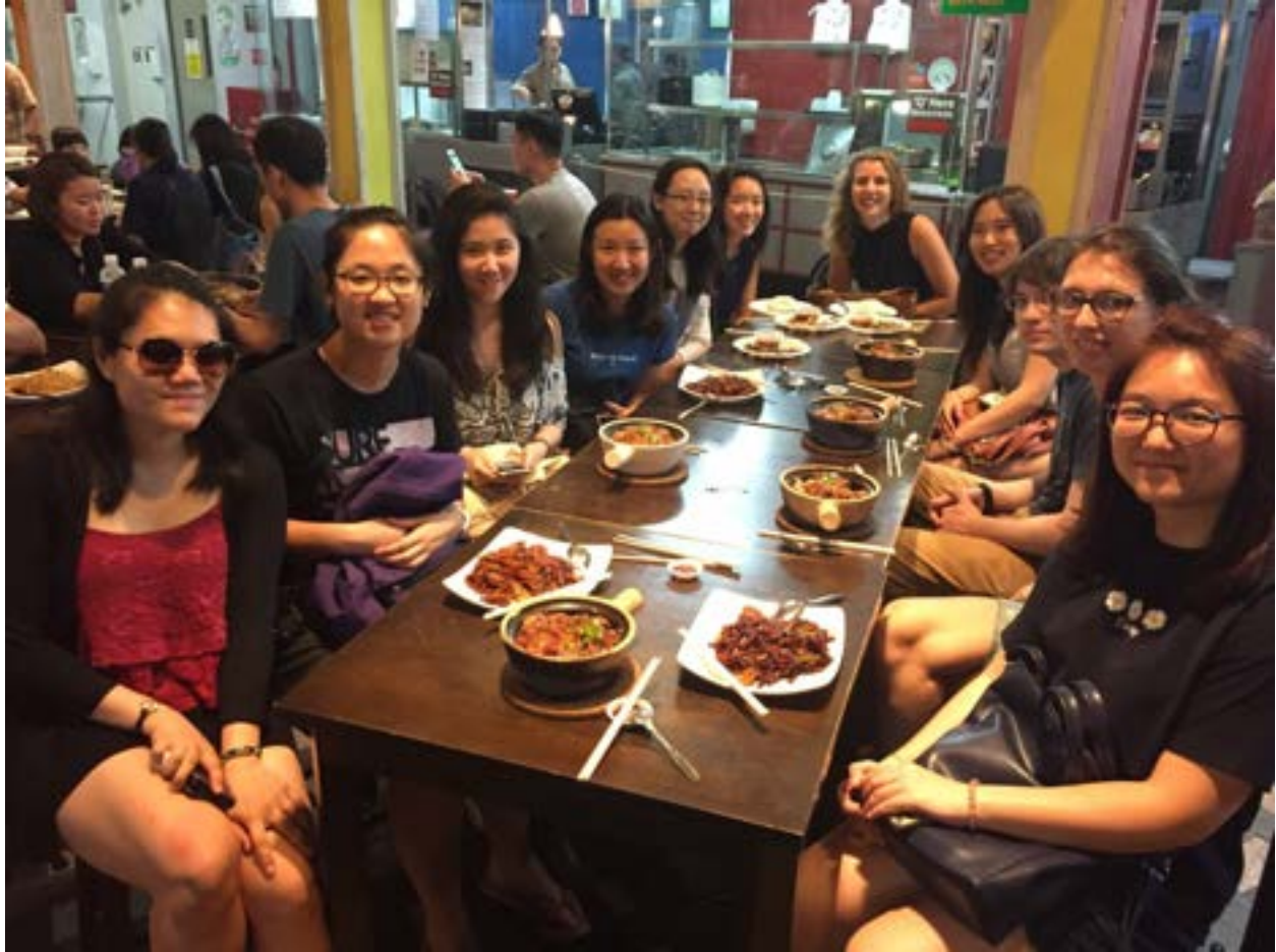
Trying local food