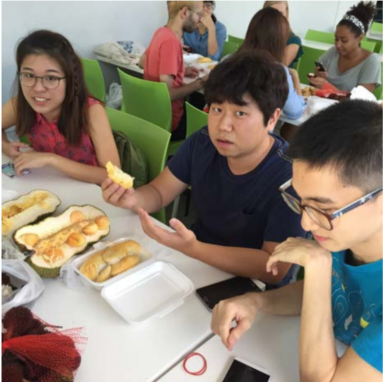
The fruits taste weird to a Korean like me