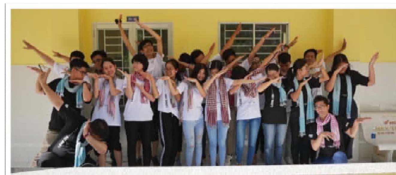
Lens on Mekong continues... (in An Giang this August 2019!)

I would like to thank Young Southeast Asia Leadership Initiative (YSEALI) and OG Department Stores for giving my team the grants to create this workshop. We will continue to empower regional youths and create more impact along Mekong Delta.