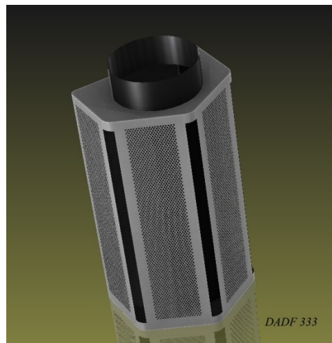
Vision effect of Air Displacement Diffusor