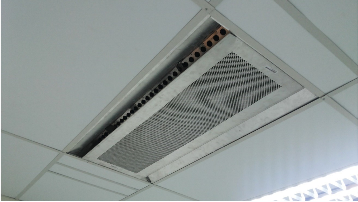
Photo of Active Air Terminals