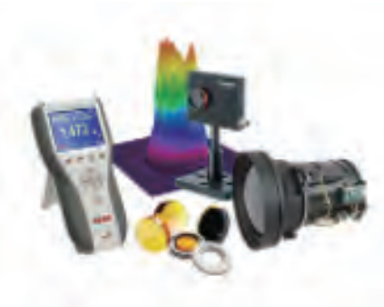
Ophir Optics & Photonics