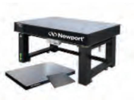
Tables & Isolation Systems