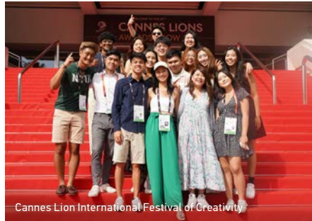
Cannes Lion International Festival of Creativity

Students will meet the biggest names in the creative communications industry who inspire, challenge and move the industry forward.