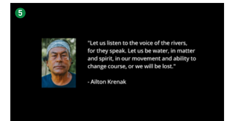
5 Scenes of the Election in Cuiabá: Far Right Despises Political Debate on Environmental Destruction Director: Pedro Oliveira Duration: 8 minutes 58 seconds

AGON: Constructions of Democracy is a film essay that experiments with the reconciliation of academic and artistic approaches. It is an invitation to consider what democracy is and what it can be, how it is linked to space, how it is a location of political struggle, and how it is threatened and always in need of active protection.