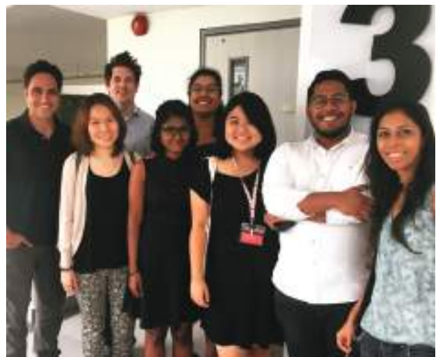
Mr Rajiv Joseph (Leftmost) with HSS faculty and students

Mr Joseph is the winner of numerous playwriting awards and was nominated for the Pulitzer Prize in 2010 for Bengal Tiger at the Baghdad Zoo .