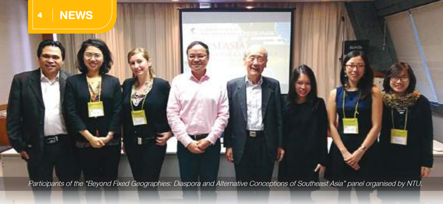
Participants of the "Beyond Fixed Geographies: Diaspora and Alternative Conceptions of Southeast Asia" panel organised by NTU.