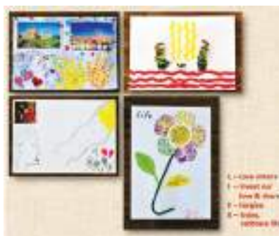
Some of the artworks by MCAT participants

To date, more than 60 palliative care professionals including doctors, nurses, social workers and personal care workers have participated in and completed the MCAT supervision and are able to apply their learning to their work.