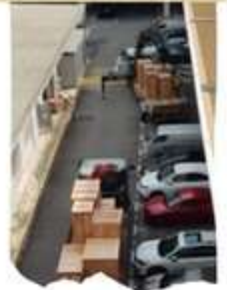
Gas Installation Work