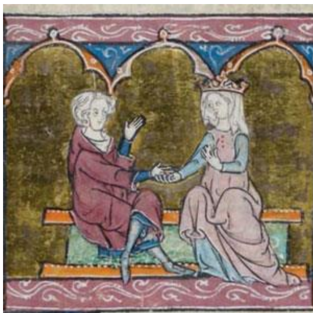
Lancelot and Guinevere in conversation, from British Library MS Add. 10293, f. 199 (c. 1316).