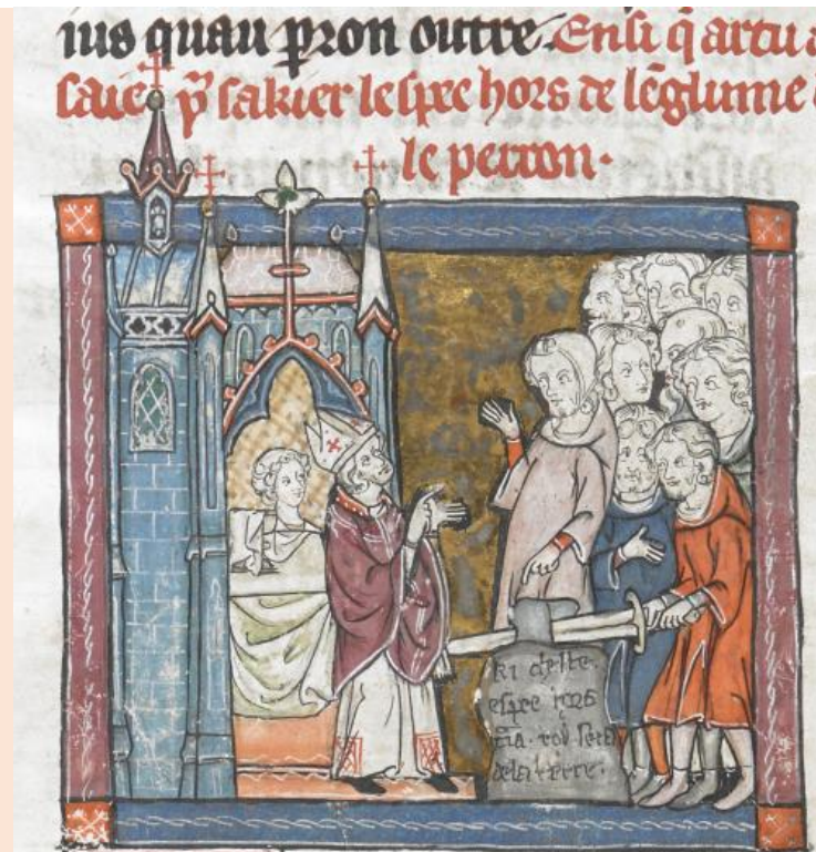
Arthur drawing the sword from the stone, from British Library, Add MS 10292, f. 99r (c. 1316).