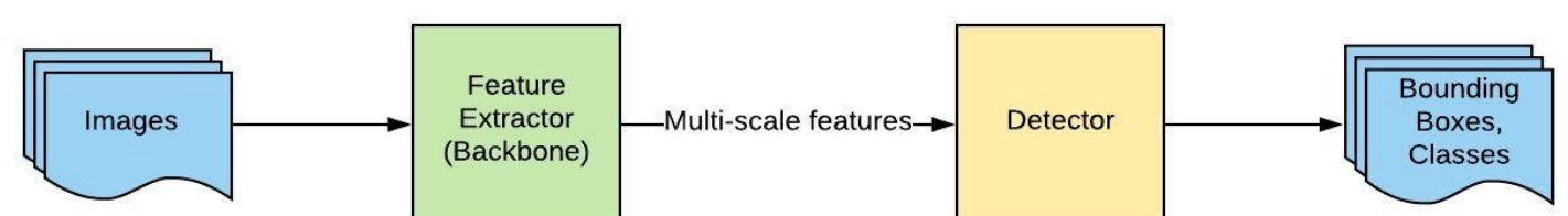
Figure 2: YOLOv3 Network Architecture

Repeating this process gives ID and OOD object dataset needed to train OOD classifier and find the OODL. Empirically prove the efficacy of this approach by applying it to YOLOv3 model.