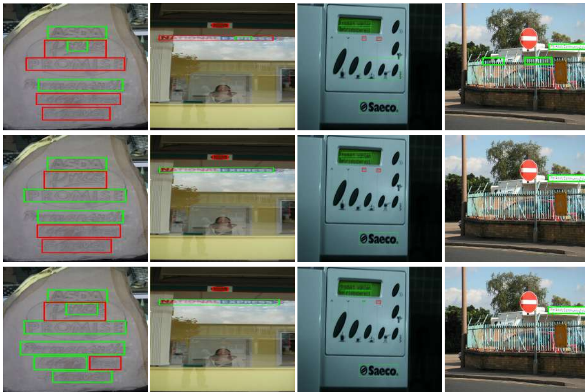
Figure 6: Comparison of text detection approach. Images from top to bottom are the text extraction outputs of the “Baseline”, “FORU.Weakly” and “COCO-Text.Weakly” character detectors, respectively. Green boxes are outputs of our methods and red boxes are missing detections.

The proposed technique is also fast. For the ICDAR 2013 test dataset, the proposed character detection model takes 0.19s per image and the text line extraction takes about 0.13s per image on Titan X GPU. The total processing time is about 0.32s on average which shows very good potential for various real-time scene text reading tasks.