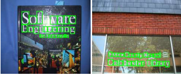
Figure 3: Character detection by the baseline model trained using the ICDAR 2013 training images. Thicker bounding boxes indicate higher detection confidence.

larger than general objects in scenes. We therefore keep the top 1000 candidates before NMS and the top 500 detections after NMS per images instead of top 400 and top 200 as used in [18]. Examples of the proposed character detection model are given in Figure 3 (the thickness of the box boundary lines indicates the detection confidence).