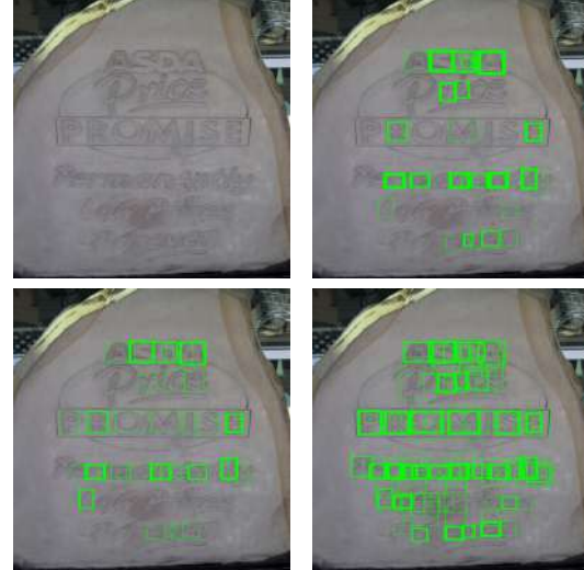
Figure 4: Comparison of different character detectors. Images in the top row from left to right are the input image and output of the baseline detector. Images in the bottom row from left to right are outputs of “COCO-Text.Semi” and “COCO-Text.Weakly” detectors, respectively. The thickness of the box boundary lines indicates the detection confidence.

In the WeText system as illustrated in Figure 2, we first run the pre-trained model M on the unannotated dataset R . For each image in R , the model M returns a set of candidate character bounding boxes as well as the corresponding detection score C = \{(c_1, s_1), (c_2, s_2), \dots, (c_i, s_i), \dots\} . The positive character samples can be identified by a confidence