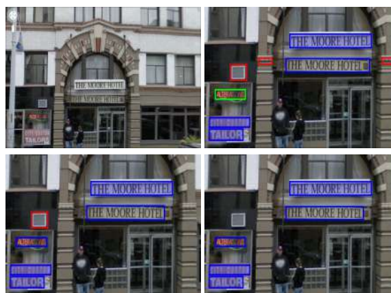
Figure 1: Text detection examples of the proposed WeText system. In the top row from left to right are one sample image and detection outputs using the baseline model. Images in the bottom row from left to right are text detections using the proposed semi-supervised and weakly supervised learning approaches, respectively. Blue boxes indicate correct detections while red boxes and green boxes indicate false positives and false negatives, respectively. Detection results have been zoomed in for better visualization.

Automatic reading texts in scene images has attracted growing interest in recent years due to its great advantages in image content understanding and contextual information inference. It has been widely used in various tasks such as multilingual image translation (Google translate [31]), ve-