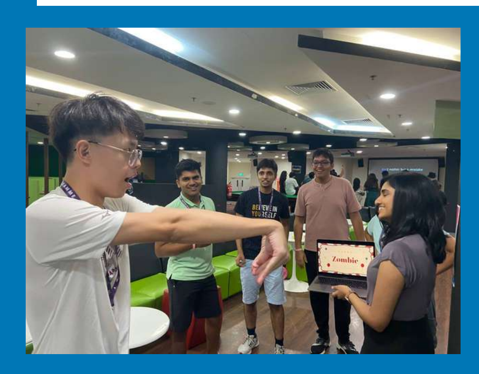
Integration Night 2022