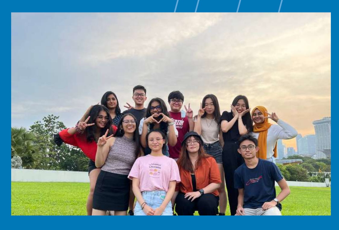
Bonding Day @Marina Barrage