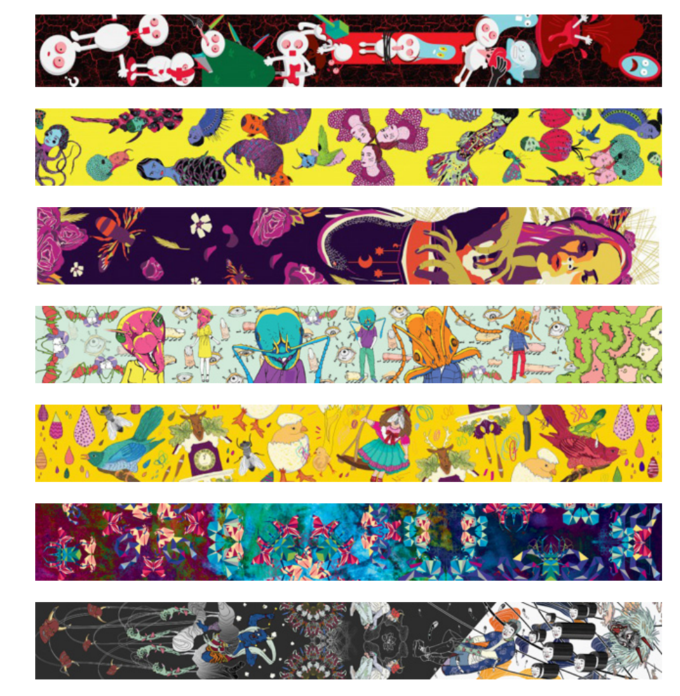
Dazzling canvas: Two-dimensional creations by students from the School of Art, Design & Media are turned into an eye-popping real-time visual showcase.