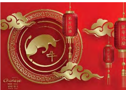
Happy Chinese New Year! Wishing you good health and much wealth during the year of the bull!