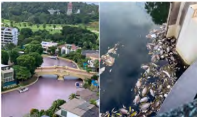
Federico Lauro could explain the purple waters and dead fish.