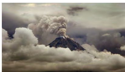
Merapi volcano in Java