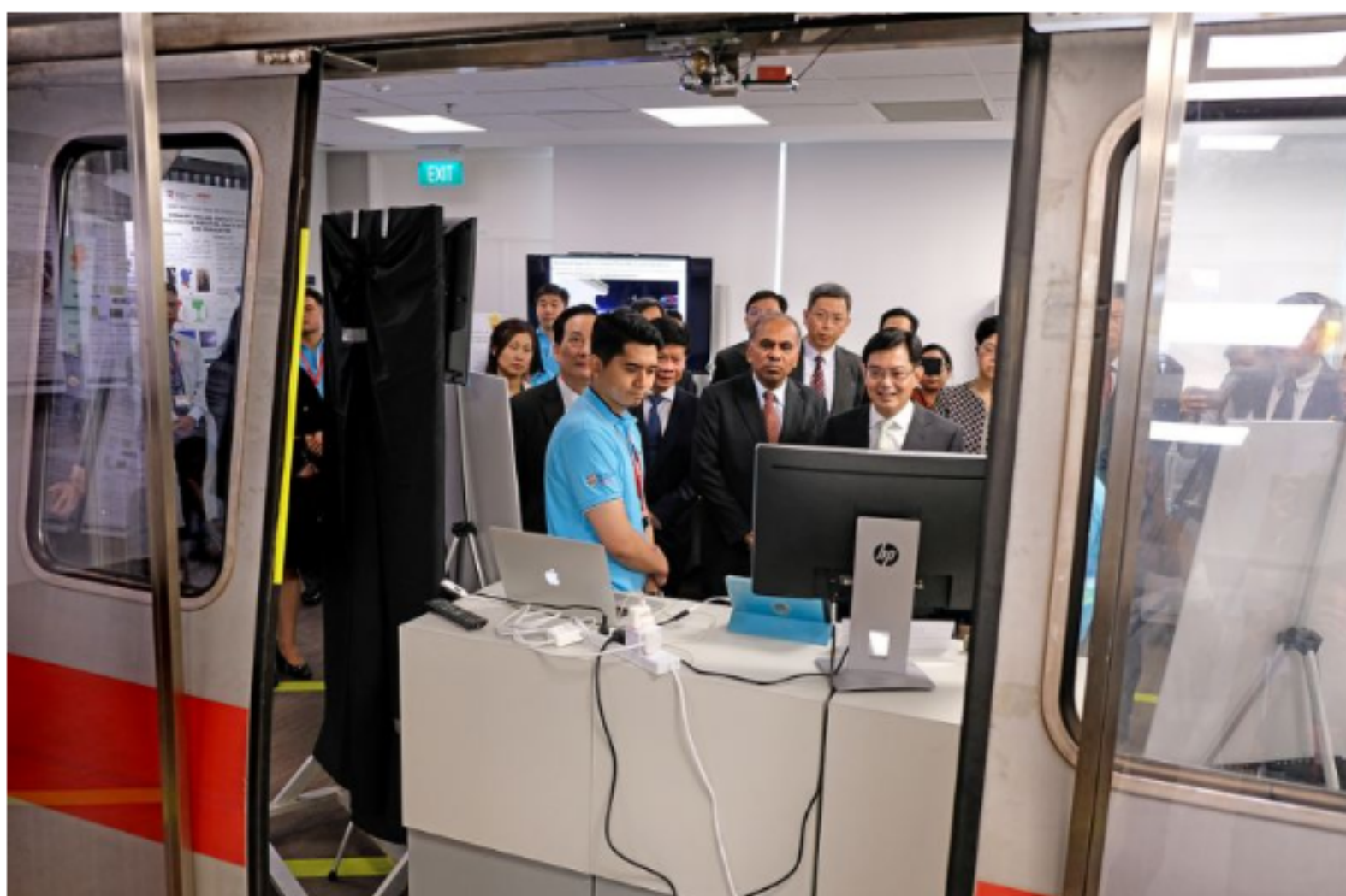
Finance Minister Heng Swee Keat (right, in glasses) attending the official opening of the SMRT-NTU Smart Urban Rail Corporate Laboratory on 29 August, 2018.

Rail operator SMRT and Nanyang Technology University (NTU) are teaming up to develop and trial multiple innovations aimed at improving rail reliability and safety.