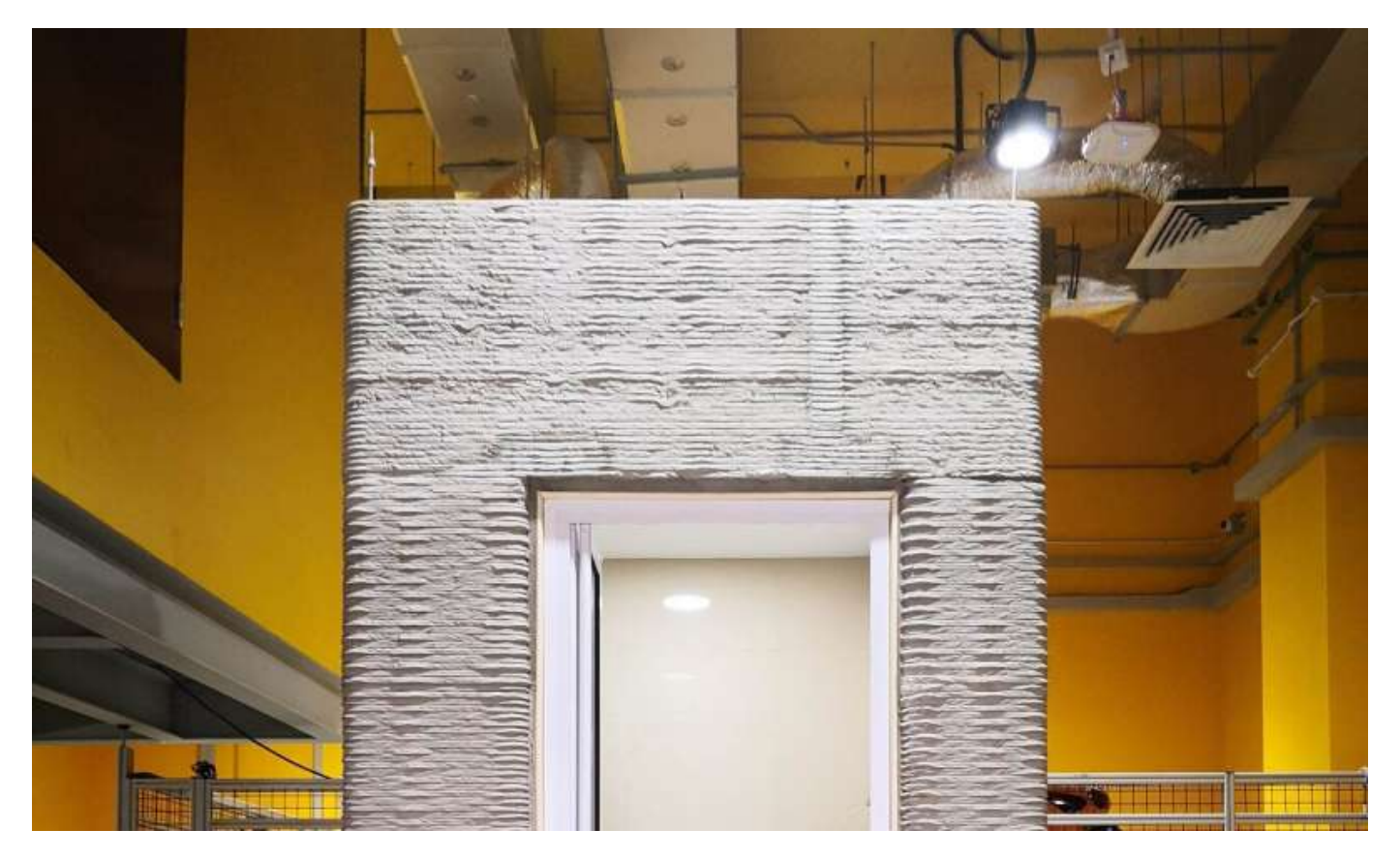
A completed fully-furnished prefabricated bathroom unit.

The printing was then carried out in a single build using a 6-axis KUKA Robotic arm, which has a reach of about 6 metres in diameter. The specially designed concrete mixture was fed to mixers and pumped out of a nozzle mounted on the robotic arm, depositing the material layer by layer according to the digital blueprint.