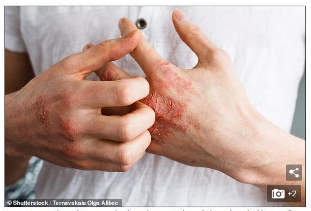
Eczema is a condition that causes the skin to become itchy, red, dry and cracked (pictured)

Only 15 per cent of the apps studied by Nanyang Technological University in Singapore contained information about drug treatments in line with international guidelines, and one in ten failed to mention any of the main therapies recommended by the National Health Service such as moisturisers.