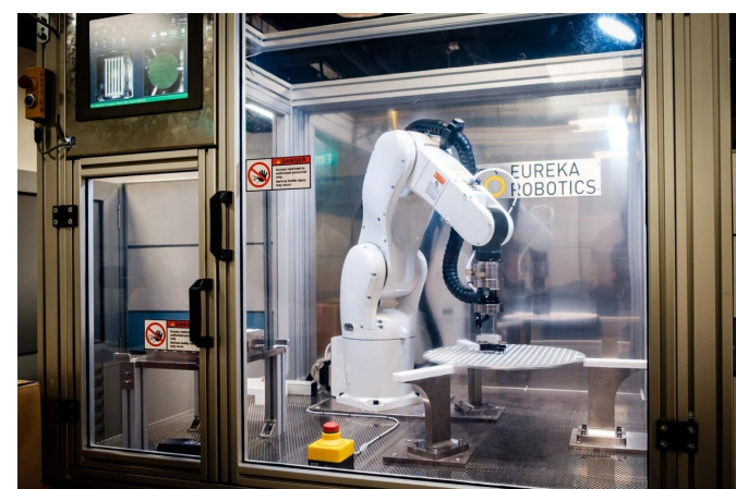
NTU spinoff company Eureka Robotics developed