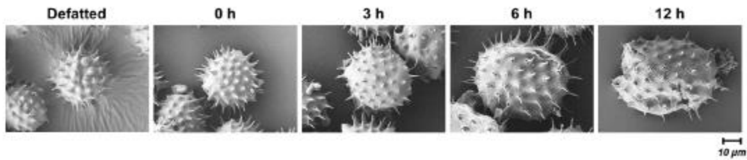
Image 2: The sunflower pollen grain undergoes structural changes in its wall structure as the incubation time in an alkaline condition increases.