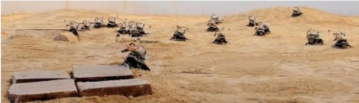
Figure 2: Still photo of cyborg insect swarm navigation. The front left insect (nearest to camera) is the leader.

This “tour leader” approach allows the swarm to adapt dynamically, as the insects can assist each other to overcome obstacles, adjusting their movements if one member becomes trapped.