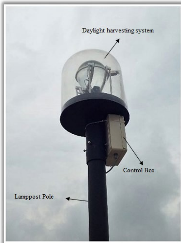
Image 3: The 'smart' device to harvest daylight when installed on top of a lamp post pole