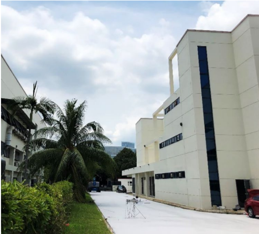
Image: The road pavement and walls of the test-site in Singapore with cool paint coatings.