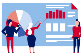
Technology, Data and Research