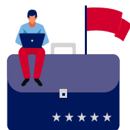
Professional Development Skills