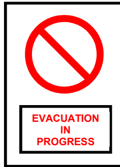
Figure 1: “EVACUATION IN PROGRESS” signage