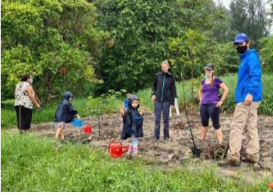
Who would have thought planting trees in the rain and mud could be so much fun!