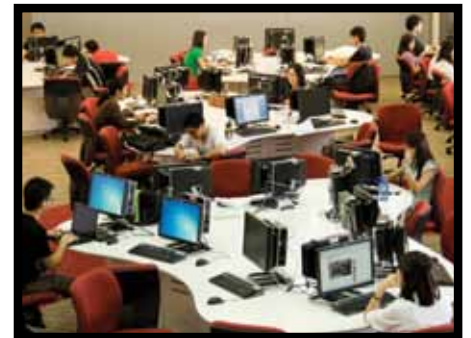
Business Library Learning Commons - 2011