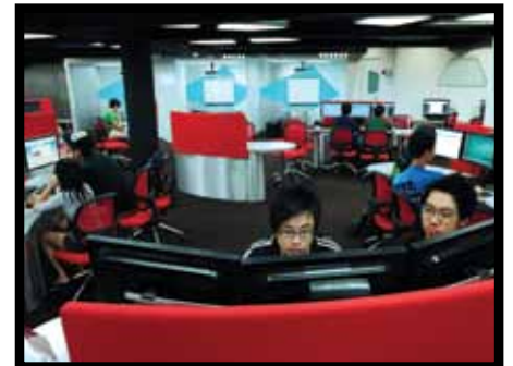
Lee Wee Nam Learning Commons - 2010