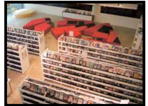
Art, Design & Media Library - 2007

Libraries that continue to be popular places for students on campus are also more likely to be those evolving and responding to changes in users' needs in a rapidly changing information landscape. The increasing availability and accessibility to information encourage a different mode of learning that is more collaborative and self-directed. As a result, many libraries gradually started to experiment with different types of spaces for their users to facilitate the new ways of teaching and learning. The main idea is creating a space that integrates essential services on campus, such as computing and library services, enabling students to engage in their learning tasks effectively and efficiently.