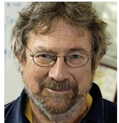
John Michael Kosterlitz