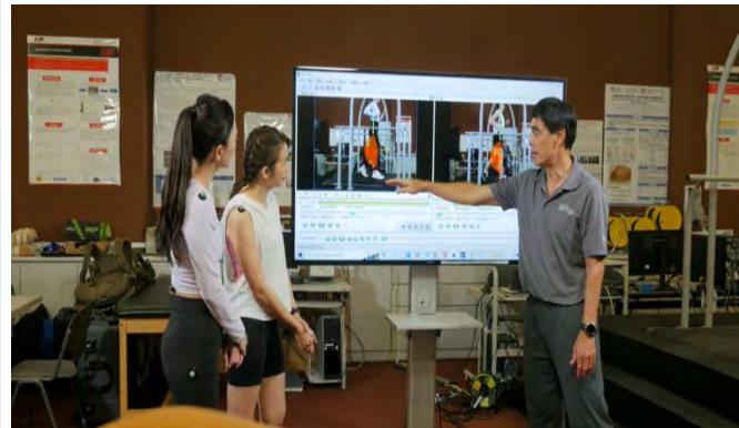
狮城有约 | 十分访谈：东南亚运动会