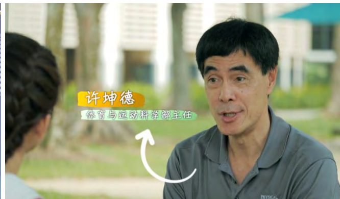
狮城有约 | 十分访谈：东南亚运动会