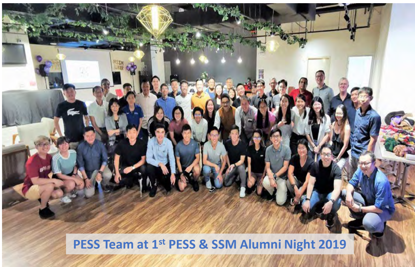
PESS Team at 1 st PESS & SSM Alumni Night 2019