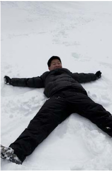
Snow fun: At Mount Rainier National Park in the US