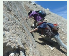
California - Geoscience