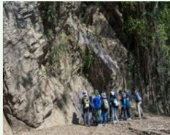
Mount Batur - Geoscience