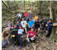
Taiwan - Ecology

Students will have the opportunity to participate in overseas advanced field courses, depending on the specialisations they have chosen.