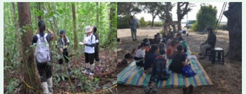
Sri Lanka - Ecology/Society

Note: Fieldwork locations are subjected to changes