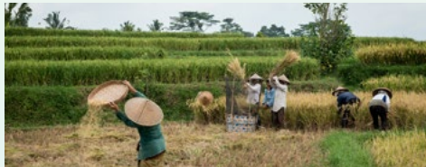
Ubud - Society