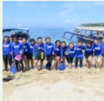
Padang Bai - Ecology