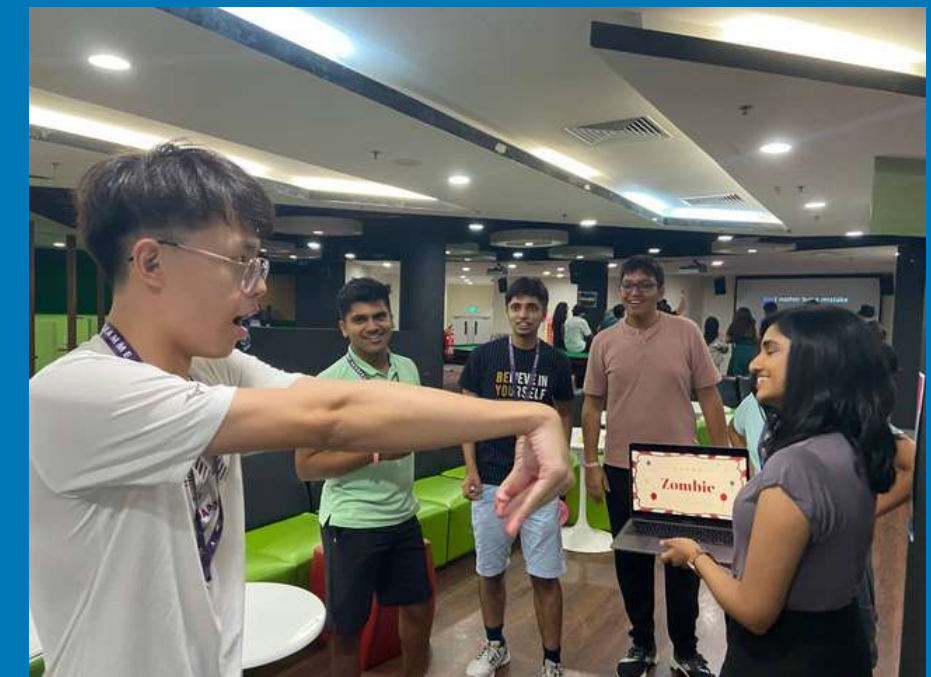
Integration Night 2022