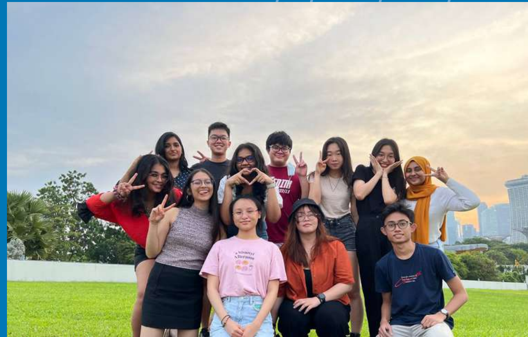
Bonding Day @Marina Barrage